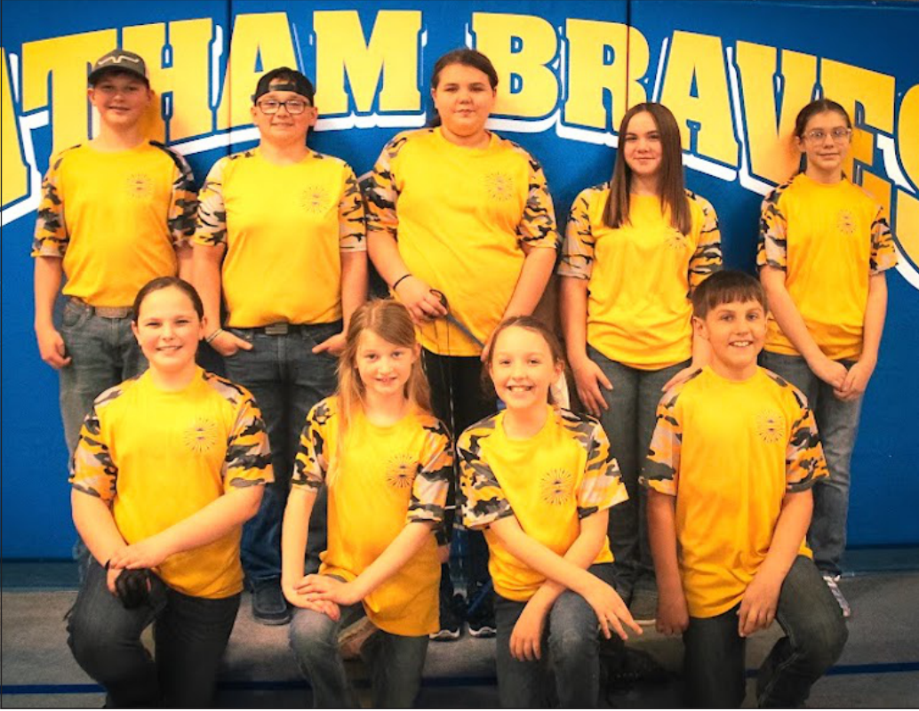
Braves head to state