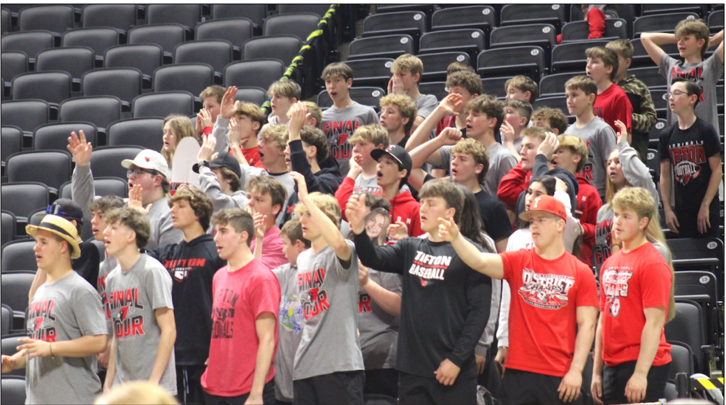
Small but loud