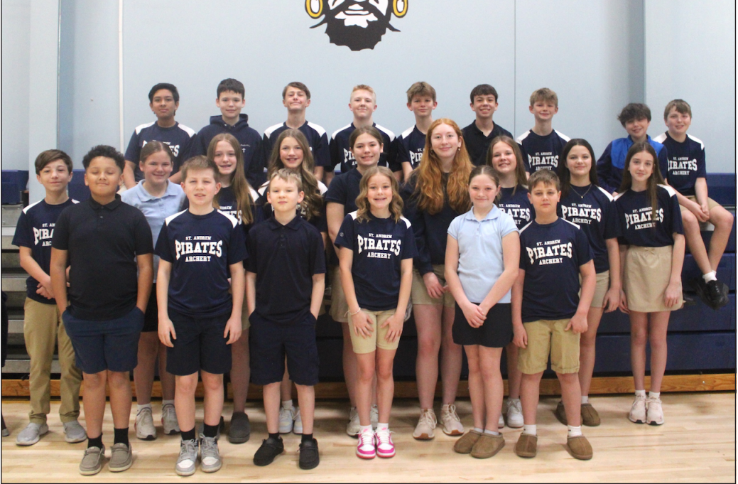
Pirate archers head to state