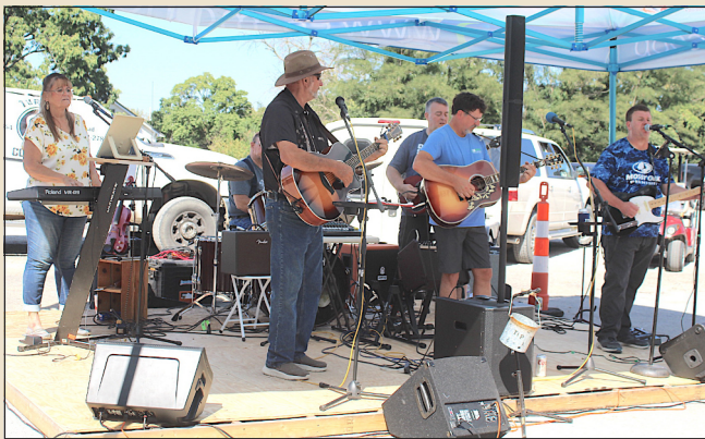
Turner & Company 2-4 p.m.