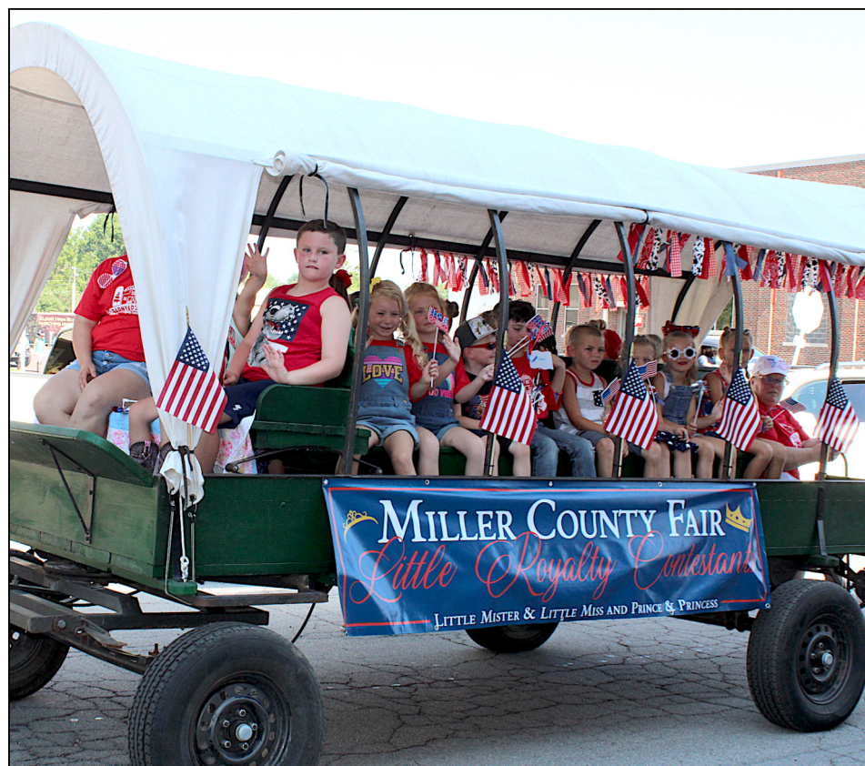
Little royalty – Children participating in the Miller County Fair Little Royalty contest ride in last year’s Miller County Youth Fair parade.

Children are also encouraged to ride in the Miller County Fair Parade at 6 p.m. Tuesday, June 25. The Little Royalty Contest will have a float for contestants to ride on.