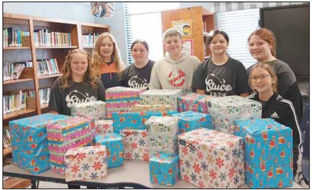
Shopping for a family of three- The High Point R-III student council recently went Christmas shopping for a family of three.

Did you know the candy cane has a means. The shape represents a "J" for Jesus, red means the blood he shed and the white means purity. The gifts we get are a gift to God. Gratitude