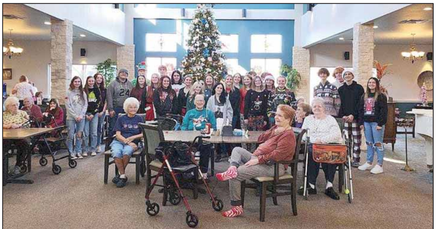
Eldon High School and Middle School choirs go caroling in the community. They are pictured at Rock Island Village

the nice list. HO HO HO! Remember to go to bed early on Christmas Eve. No peeking! Also, make sure to leave out carrots for all my reindeer and cookies and milk for me. We get very hungry delivering toys to all the good boys and girls all over the world. The reindeer and I can't wait to visit you on Christmas.