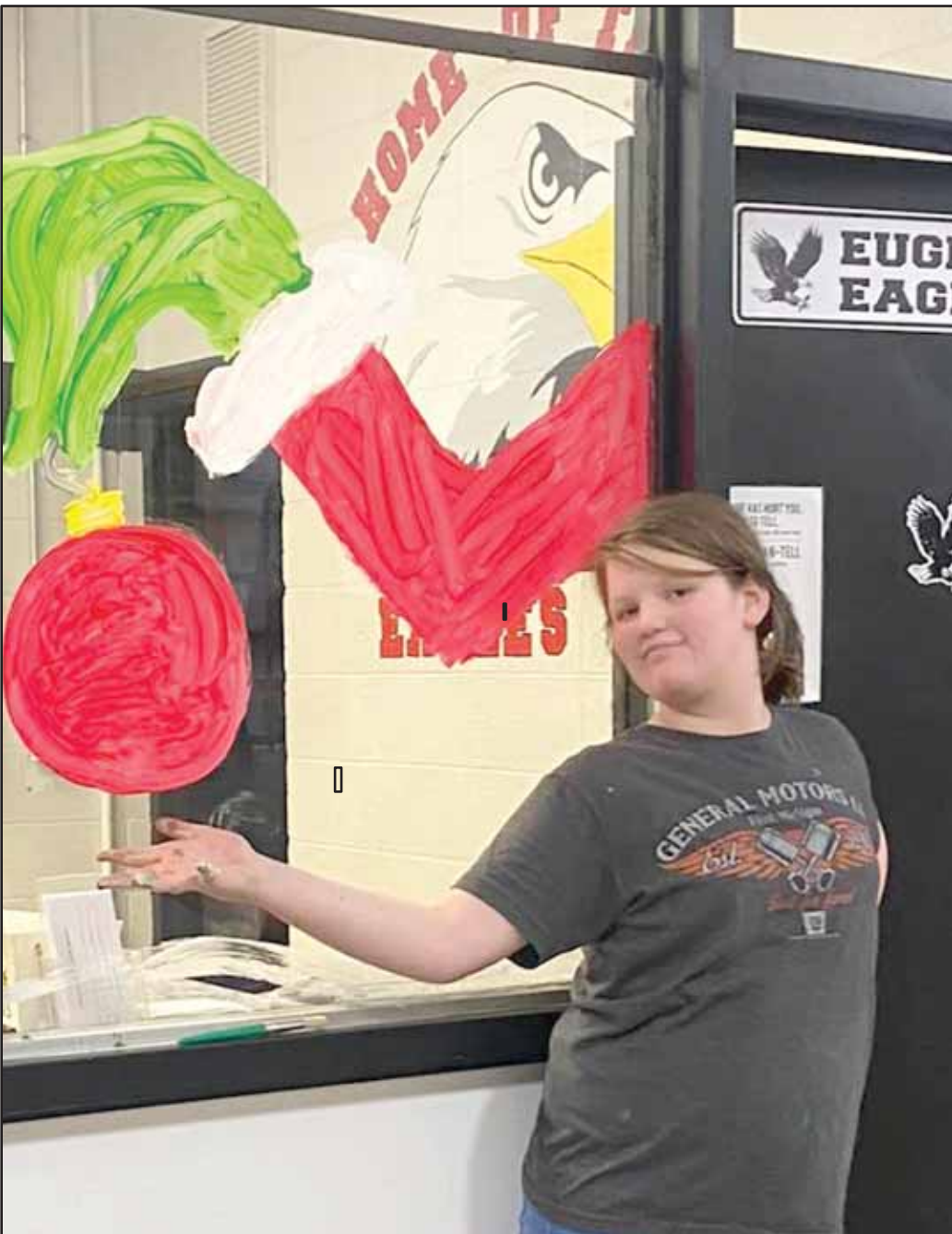
Cole R-V sixth graders recently painted Christmas themed murals in the halls