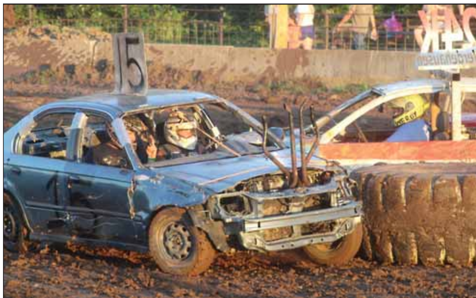
Bump and grind – Curt Turpin from Eldon, in the 15 car, circles the tire during a preliminary heat in the figure 8 derby at last year's Miller County Fair in Eldon.