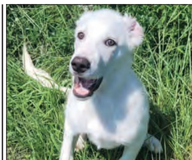
Found together on 8/2 on Darwin Ave in Monte Vista

Joker the Pyrenees Akbash mix is still here, and he's the last of his litter. He just turned 5 months old and loves everyone, kiddos included! Joker is very playful, loving, and ready for his forever home! Come meet him today!