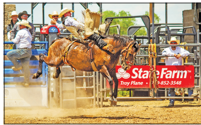
Bareback, bull riding champs determined on final day