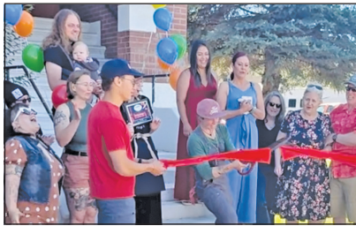
Ribbon Cutting held at Church Project