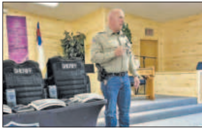
Mineral County Sheriff receives Shield616 vests