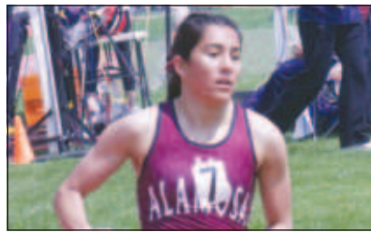
Several SLV track athletes ranked by Max Preps