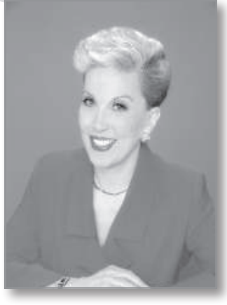
ABIGAIL VAN BUREN

daughter I felt manipulated, and I was giving them a two-month notice before ending the monthly contributions. She has now cut off all contact with us -- blocked all phones and social media. I'm devastated. I feel hopeless and I am seeking counseling. I can't shake the feeling I'm at fault. Your thoughts? -- BLOCKED IN WASHINGTON DEAR BLOCKED: Your only "fault" rests with the fact that you gave your manipulative and ungrateful daughter a LOT of money and concealed it from your husband. You can't make someone love you by buying their affection. (It's either there or it isn't.) As you can see now, doing so was fruitless. Your daughter is using your love for the grands to punish you for not forking over even more. (And she thinks YOU have a "difficult personality"? Wow!) I'm overjoyed that you will be discussing this sorry situation with a licensed mental health professional. It's the surest way I know of to quit blaming yourself and to regain your emotional balance. DEAR ABBY: I have a friend who, any time we ate out, if a server tried to take her empty plate, and others around