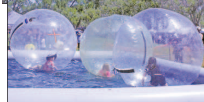
Children roll around in the Water Kicker Wow Balls.

That 90's Band performs at SummerFest on the Rio Saturday at Cole Park.