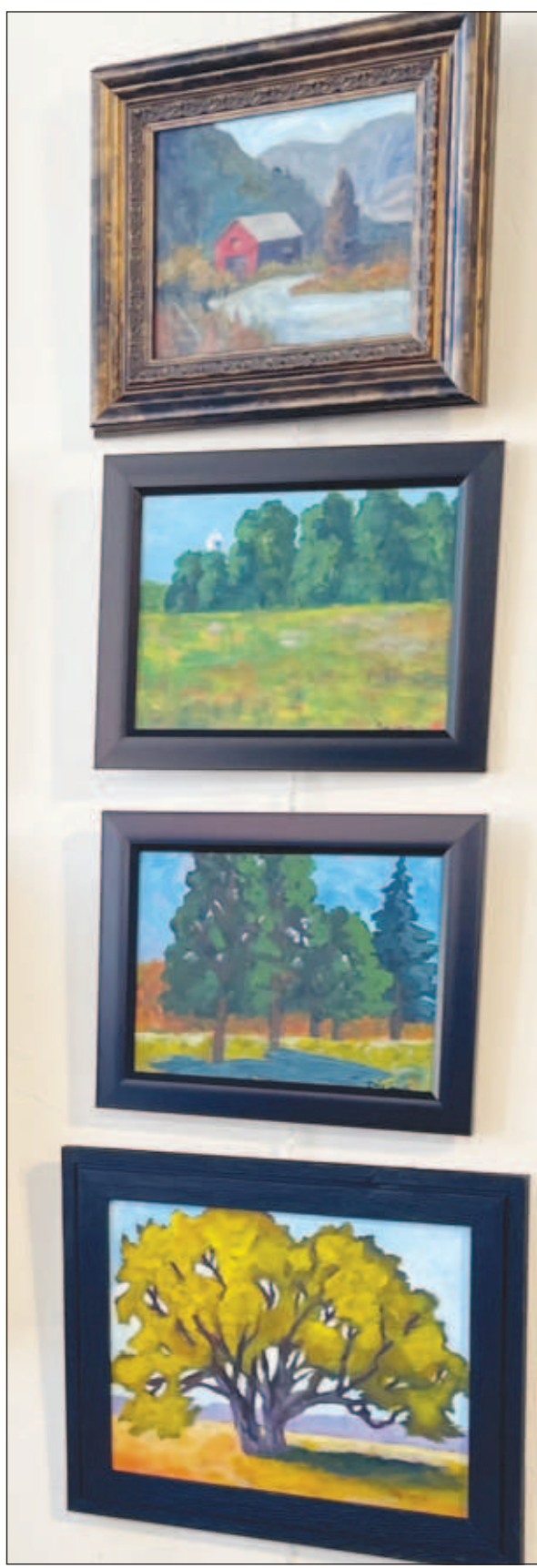
A sample of artwork on display at Milagros Coffee House in Alamosa.

Milagros Coffee House is at 529 Main St. in Alamosa, hours are 7 a.m. to 4 p.m. every day except Sunday when they are open 7 a.m. to 2 p.m.