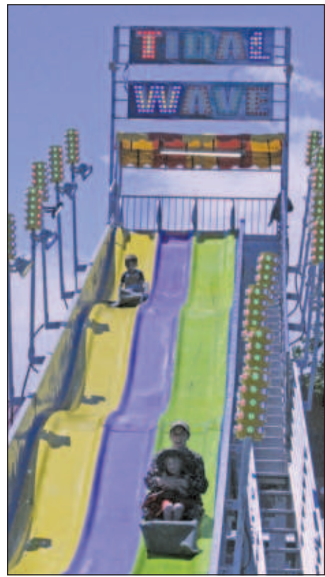
There was always traffic on the Tidal Wave fun slide.

Two children dance to the music of That 90's Band at the SummerFest on the Rio Saturday at Cole Park.