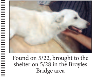
Found on 5/22, brought to the shelter on 5/28 in the Broyles Bridge area