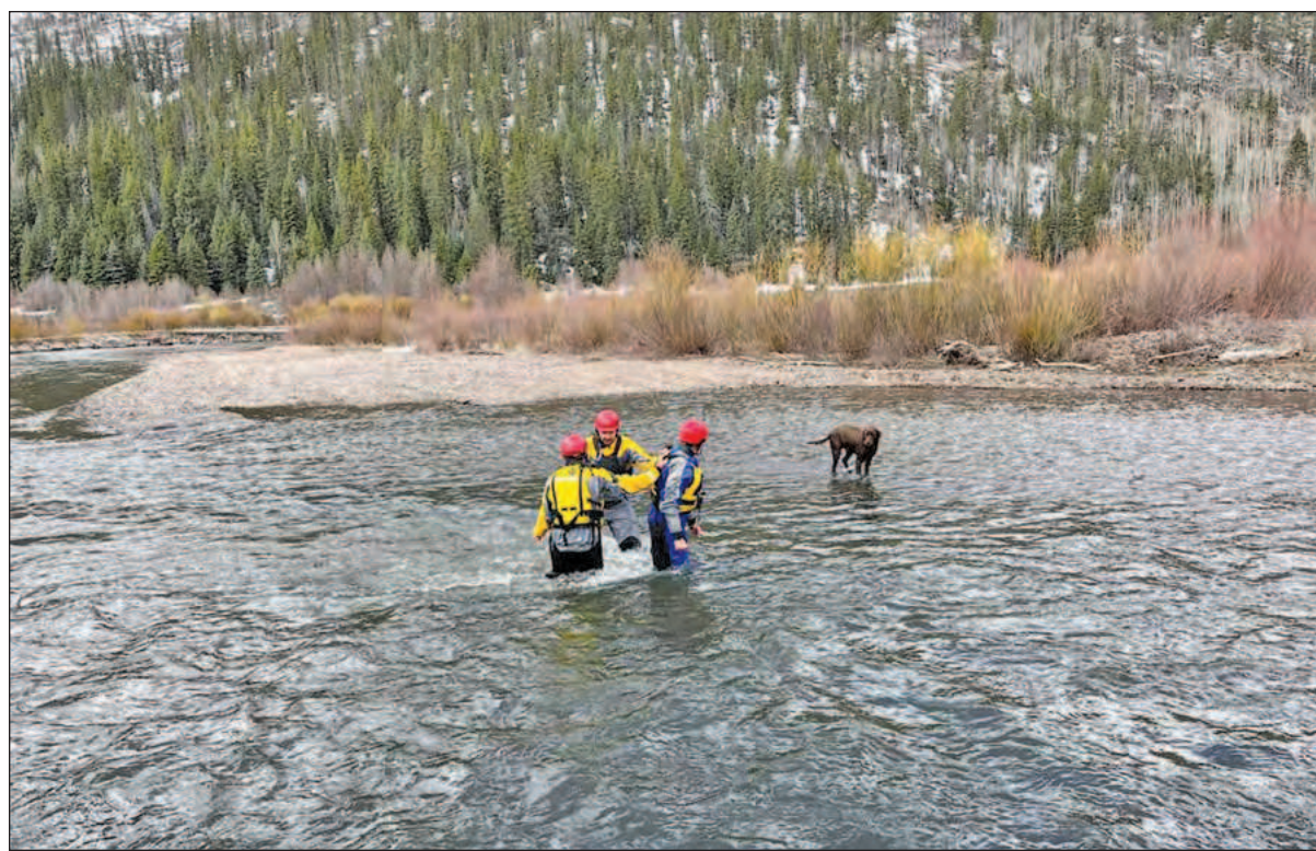
Mineral County Search and Rescue teams trained for swift water emergency response at the end of April in preparation for the coming runoff season in the western end of the San Luis Valley.

Anyone wanting to know more about swift water safety can visit www.swiftwatersafetyinstitute.com to learn safety protocols or receive training.