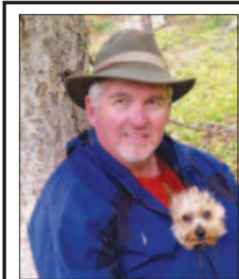
Trout Republic by Kevin Kirkpatrick

And don't forget all the other activities coming up such as Creede Bingo on Monday nights, the South Fork city garage sale, the Creede Ladies Aid sale, the Amish dinners and Amish auction, the Farmers Market in South Fork, Logger days and the list goes on