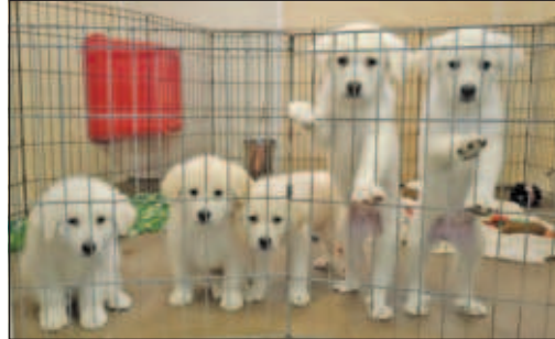
Our Pyrenees puppies are ready to meet with potential adopters, but not quite ready to meet new fur housemates, for another couple weeks. We have 4 males and 2 females, all full of love and personality! Come meet them today!