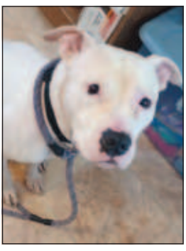
Found on 5/29 on Covey St in Monte Vista