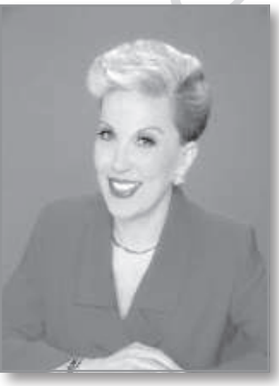
ABIGAIL VAN BUREN

DEAR REALLY WISH: The person who was really upset that you didn't buy him wine on one of those dates should have been told that you are on a fixed income and it wasn't within your budget. You should also have told him you were reciprocating within your ability. If he needed a drink that badly, he could have paid for his own. You're lucky to be rid of him. In the future, TELL the man you are seeing that after you know him better, you would love to treat him to some home-cooked meals, which might actually be nicer than what you can afford to buy him in a restaurant. He might appreciate both your candor and the food. If he doesn't, I think you will be lucky to be rid of him, too. P.S. Have you considered paying the tab for a casual breakfast, lunch or a coffee/pastry date instead of dinner?