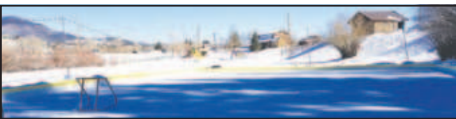
A new warming hut (below) has been built by the Town of South Fork near the ice-skating rink (above) located at Rickel Park. Skates and sleds are available for the public to use and donations are welcome.