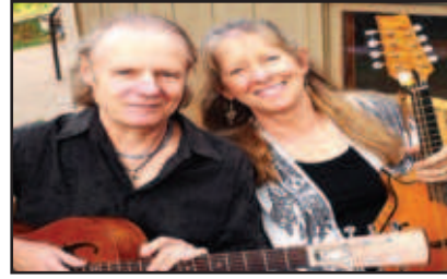
Mitguards bring unique style to Del Norte.