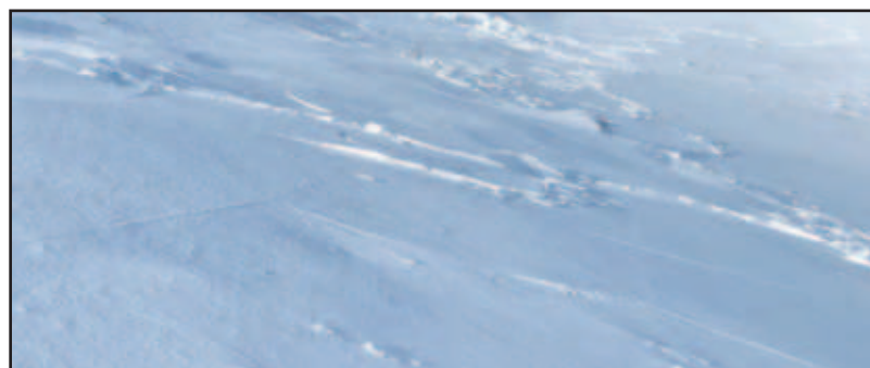
Photo of a slab avalanche caused by a person snowshoeing at the top of the ridge.