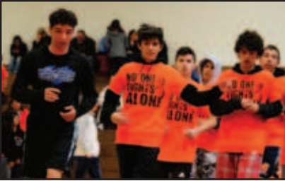
Centuari hosts Alamosa for wrestling dual