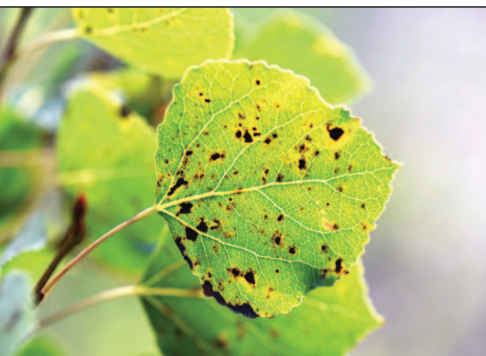
Wet spring conditions in 2019 also created favorable conditions for several species of leaf fungi, which can cause early leaf drop and spotting on leaves of cottonwood, aspen and poplar trees.