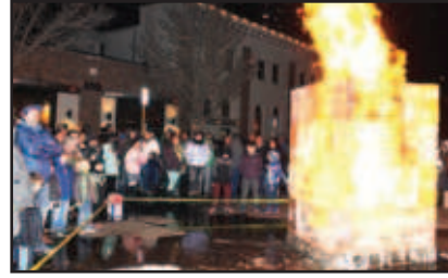
More Rio Frio Ice Fest frolics.