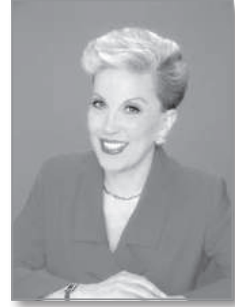
ABIGAIL VAN BUREN