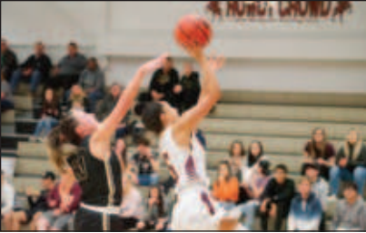
Moose at home against Pagosa Springs.