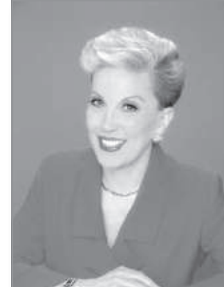
ABIGAIL VAN BUREN

chance to crisp himself up, but I would like to handle it delicately so as not to hurt his feelings. I never thought of myself as judgmental. Am I being unreasonable for wishing my new boyfriend wants to look good for me as I do for him? How do I handle this? -- SECOND THOUGHTS DEAR SECOND THOUGHTS: Here's how. Recognize that he is not your "new boyfriend"; he is only a candidate for the "job." Go out with him a few more times and get to know him well enough that you can have an honest conversation with him. If he doesn't shape up, at that point, tell him what you told me. Leave out the part about blaming yourself for your feelings. They are honest, and you are entitled to them, and frankly, you might be doing him a favor to speak up.