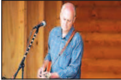
Society Hall set for ALMA & Friends concert.