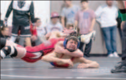
Regional wrestling action in the books. Next up, state tournament.