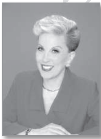
ABIGAIL VAN BUREN