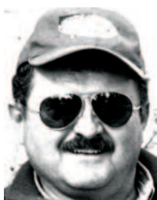
Grande Sportsman's Club and International Single Shot Association and participated in many Schuetzenfest

competitions at the NRA Whittington Center in Raton.