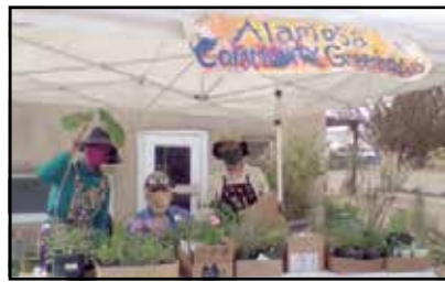
Community Garden accepting pre-orders