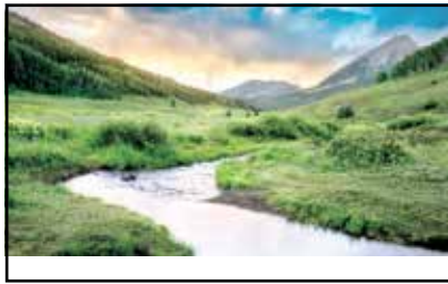
Colorado water listening sessions