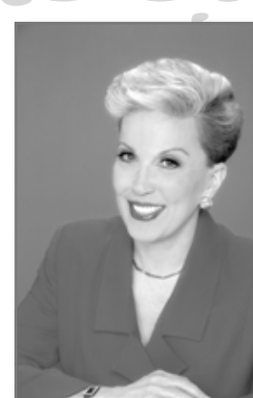
ABIGAIL VAN BUREN