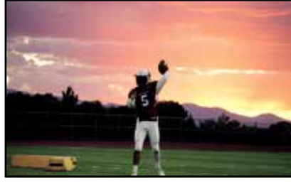
CHSAA task force begins tackling resocialization