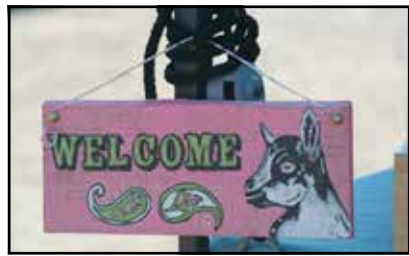
Alamosa Farmers Market