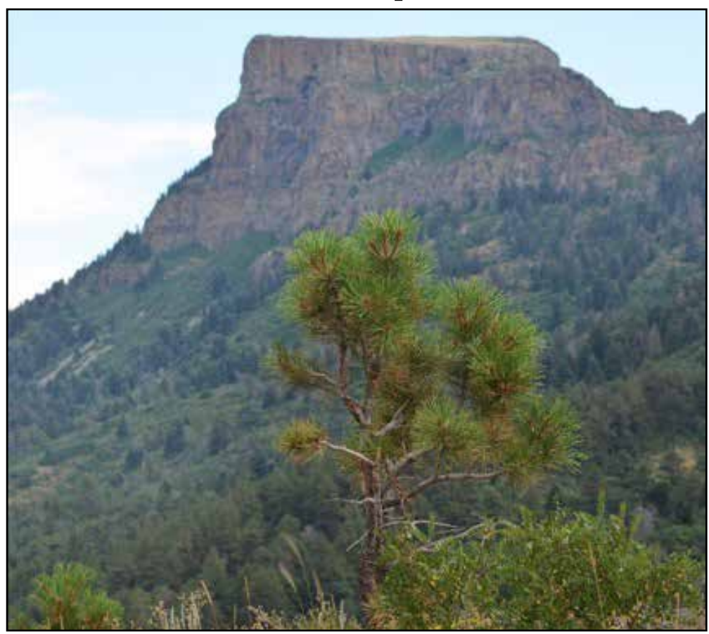
A view of Fishers Peak from the property that will become Colorado's next state park. Senate Bill 3 provides $1 million toward the park's continuing development.

Though Senate Bill 3 has undergone several iterations as the state made adjustments for the costs of the COVID-19 pandemic, Gov. Jared Polis, the Colorado Department of Natural Resources and Colorado Parks and Wildlife remain committed to creating a state park with input from the local community, sportspeople and other conservation stakeholders.