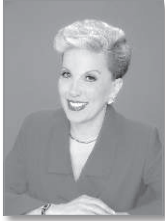
ABIGAIL VAN BUREN

an option, I have found writing to be helpful. A cheap spiral-bound school notebook works great. The idea is to write at least one full page every day. Some days, all I can say is, "I don't want to write," but I fill that page anyway, so that the commitment is met. However, other days I find I can pour my heart out, unload the things that are hurting me, express my anger, resentments, disappointments and longings. Sometimes, while I'm waiting for the thoughts to come, an insight or solution will present itself. Because I'm afraid of my thoughts being found and read by someone else, I destroy each page after it's written. Names can be disguised. The simple act of getting those thoughts out of my head and onto paper helps to relieve stress tremendously. Just thought I'd share this with you. -- WRITING IT DOWN IN THE EAST DEAR WRITING: Writing or journaling is a very effective way to organize one's thoughts and purge negative emotions. I'm glad you suggested it because I think it may help some of my readers. Thank you! DEAR ABBY: I babysit my nieces and nephews. While we are grocery shopping and we get to the checkout, they'll ask for candy or chips. If I tell them no, it's usually