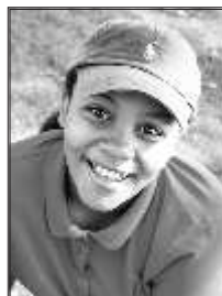
'Kids Like Me'