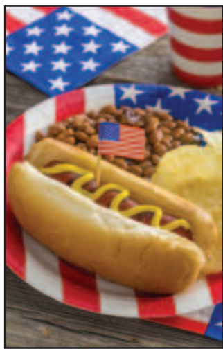
The relaxed nature of summer often pervades Fourth of July festivities, but hosts can still take a crash course in summer hosting to ensure everyone has a good time.

tion home for guests. To make sure everyone gets home safe and sound, arrange in advance for some guests to serve as designated drivers. Hosts also should abstain from consuming alcohol during the party so they can get people home safe if necessary. Keep a list of local taxi company phone numbers on hand and encourage guests who plan to consume alcohol to use ridesharing apps to get to and from the party. Fourth of July festivities typically are less formal than other celebrations, but hosts still must plan their parties to ensure everyone has a fun, safe Independence Day. TF186060