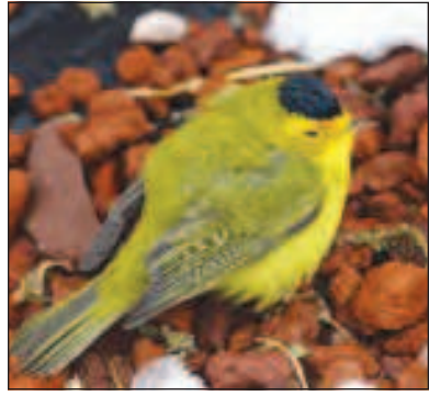
A Wilson's Warbler was one species heavily affected by the snowstorm. Here a bird is shown in torpor, and is easily approached.

Another source of bird mortality from the snowstorm was that large numbers of birds perished as a direct result of highway collisions. The deep snow effectively cut off food sources for birds, so they were forced