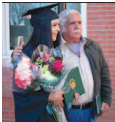
Few noticed the near-freezing temperatures as they gathered after the commencement ceremony on the front lawn of Richardson Hall to reunite with flowers, hugs and smiles for the class of 2021.