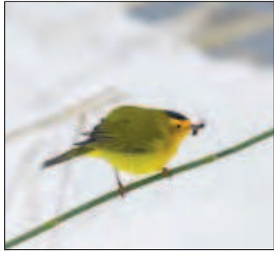
Wilson's Warblers suffered tremendous mortality from the snowstorm. This bird was lucky enough to find a spider at the water's edge.

to gather along plowed roadsides where plants and seeds were exposed along the highway edges.