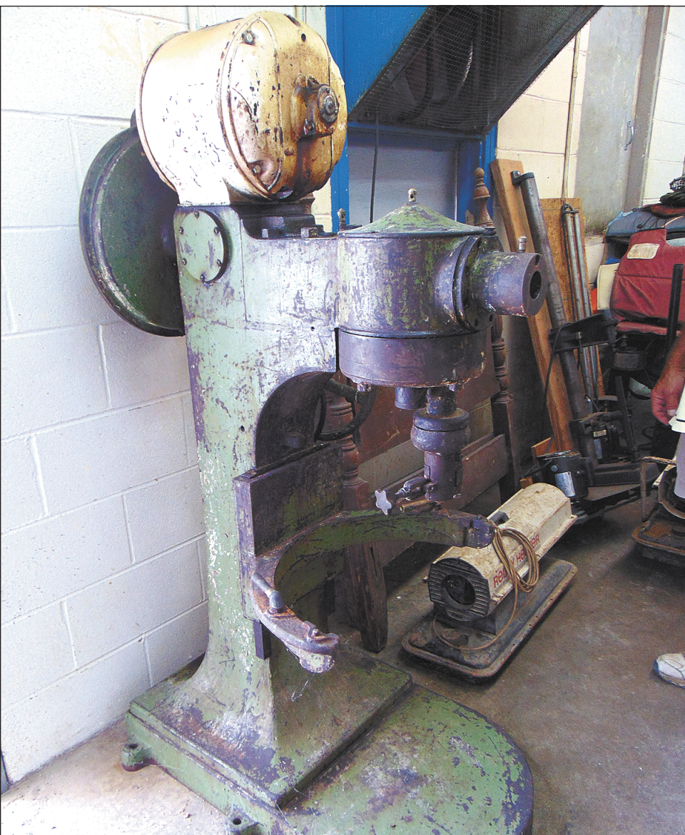
The same 1930s dough mixer the club received from Whitman's Bakery (now closed) is still up and running here in 2021.