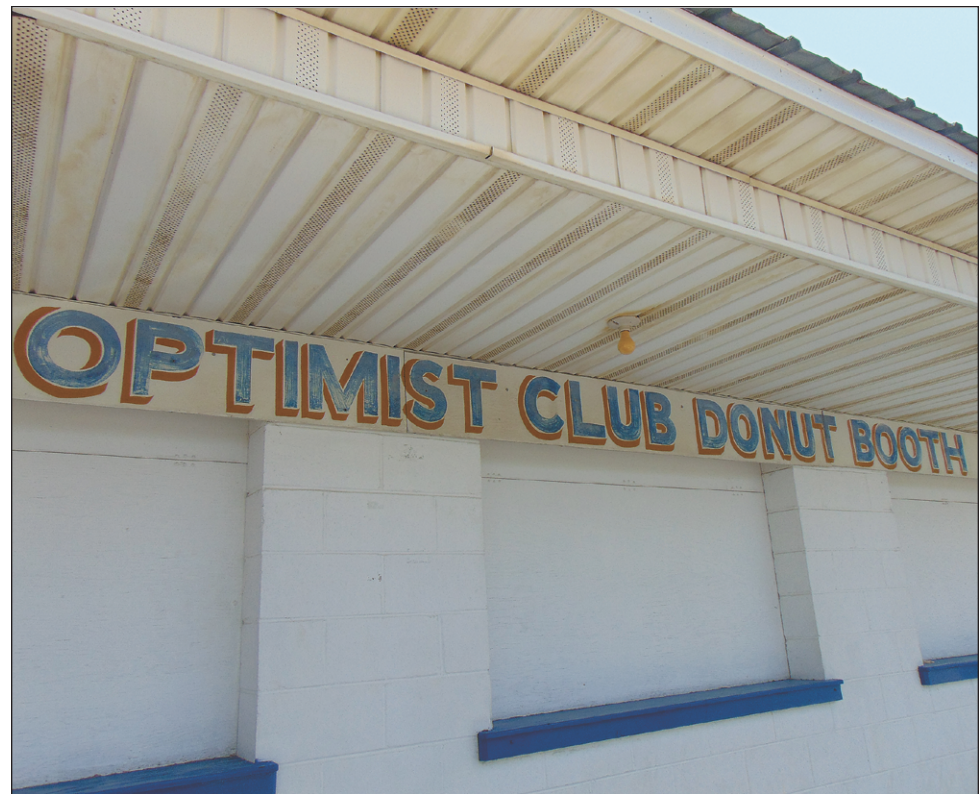
The club upgraded to their current booth in 1974 after outgrowing the Celebration barn.