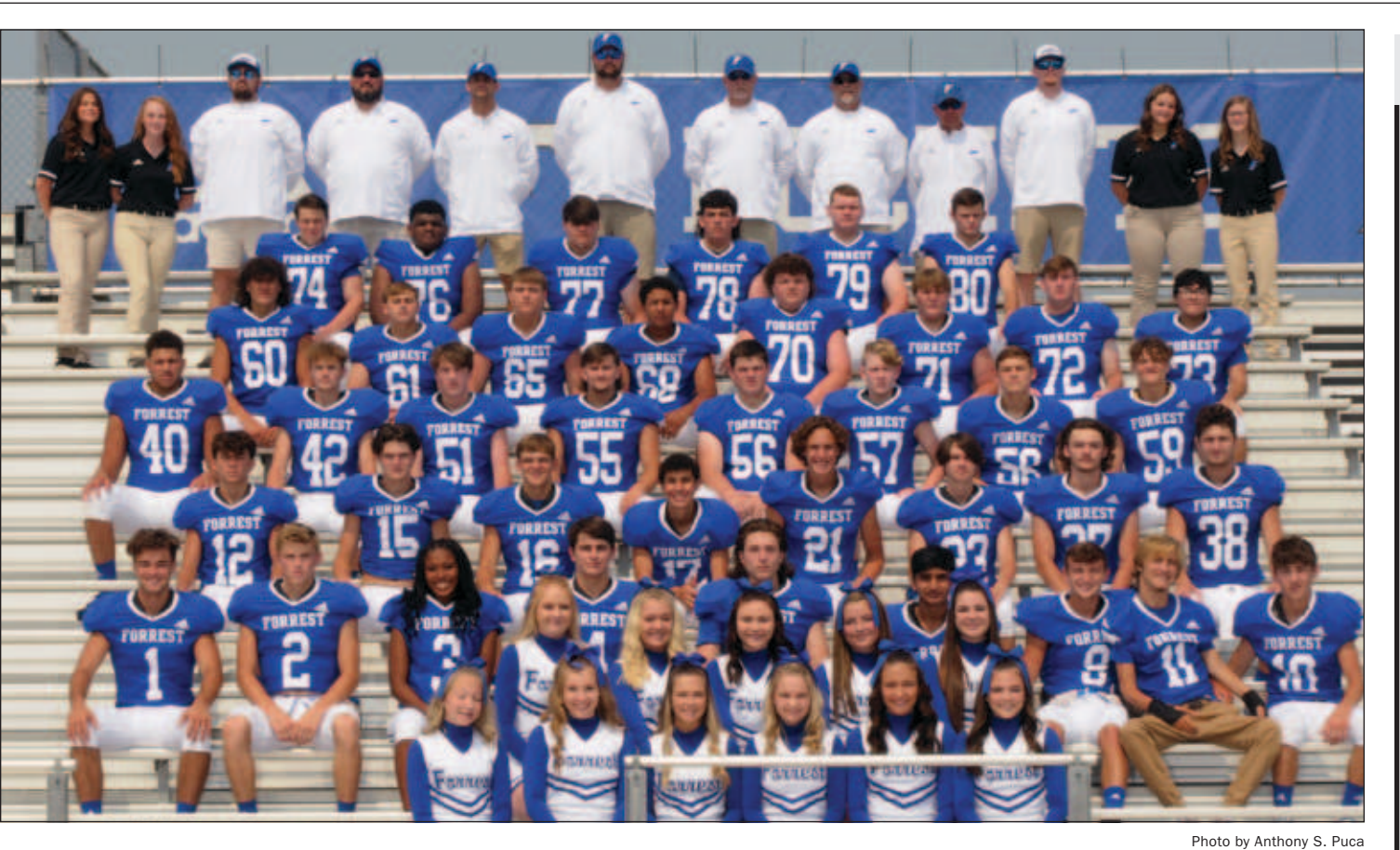
The 2021 Forrest Rockets open the season Friday night at Eagleville.