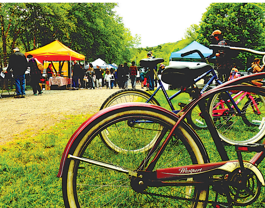
A bicycle rack at the Callicoon Farmers' Market offers riders a great spot to park.