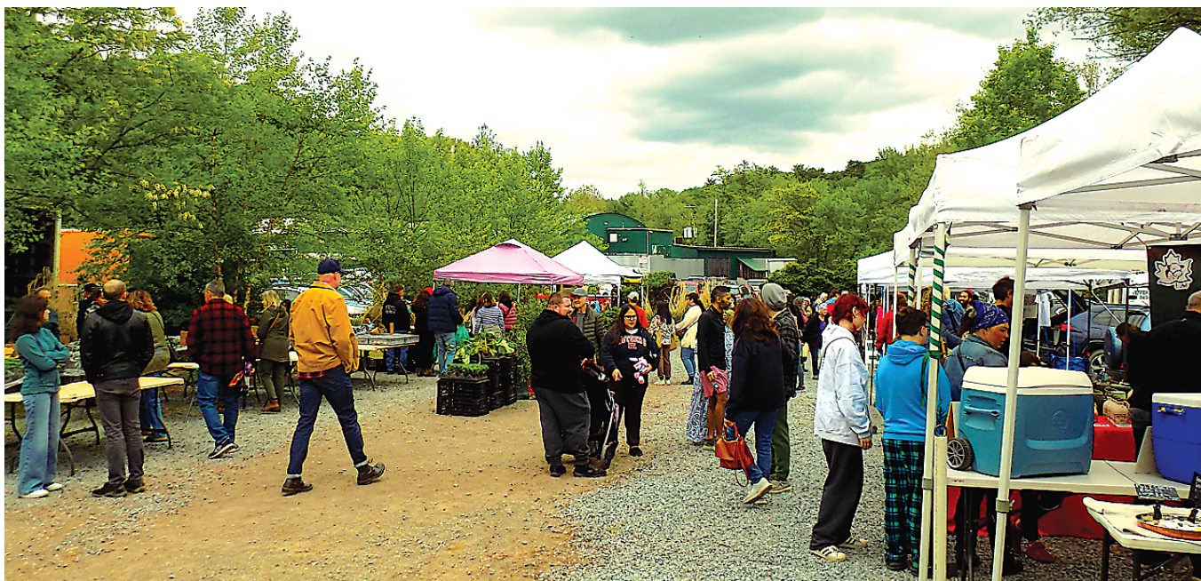
Farmers' Market shoppers on Memorial Day Weekend in Callicoon enjoy visiting and shopping at all the vendor booths.

Callicoon is a 'producer only market' meaning all vendors