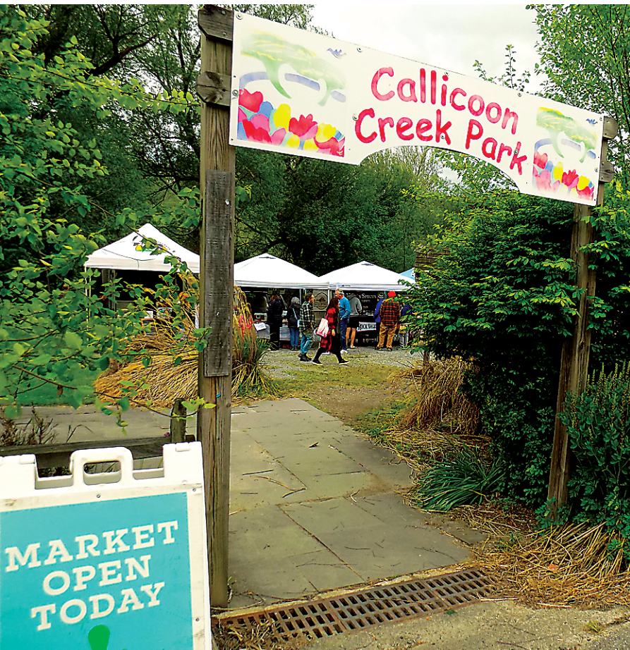
The entrance to the Farmers’ Market at the Callicoon Creek Park is a welcoming site to many shoppers every Sunday on Audley Dorrer Drive, Callicoon.