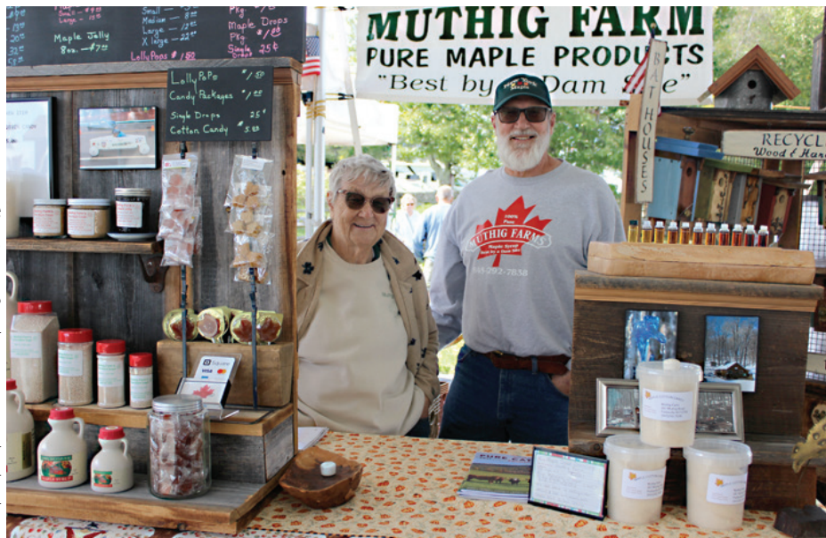
Muthig Farm has been a vendor at the Liberty Farmers' Market as well as the Harvest Fest during the fall.

The initiative centers around its seasonal markets, which run from June through October in Liberty, Woodridge, Fallsburg, Loch Sheldrake, and Monticello. These locations — consisting of one central market and four mobile sites — offer a wide selec-