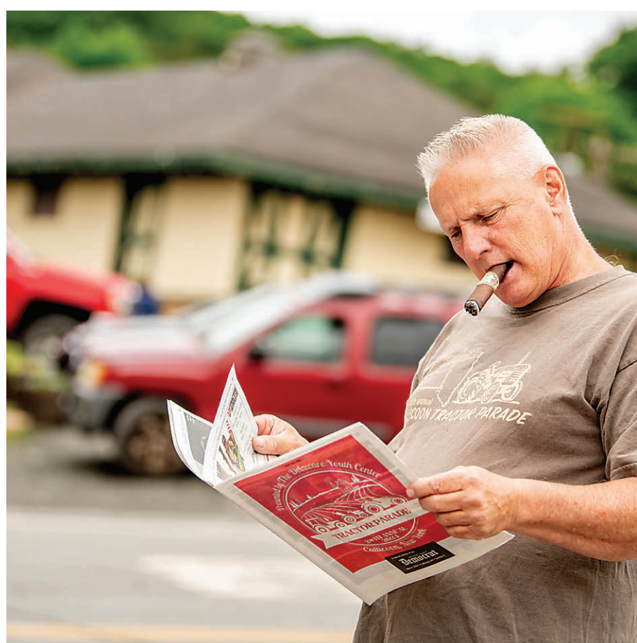
A visitor to the Callicoon Tractor Parade enjoys his complimentary copy of the Tractor Parade tab, published by the Sullivan County Democrat.

RapidRecovery AT ACHIEVE more! REHAB AND NURSING FACILITY