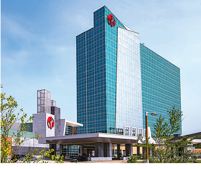
Auditions for the drama, "Where the High Ends," will be held this Saturday at Resorts World Catskills from 11 a.m. to 4 p.m.

friendships and professional relationships with talented individuals I've worked with on various productions. This story is particularly timely as so many people either know someone struggling with addiction or have been directly affected by it.