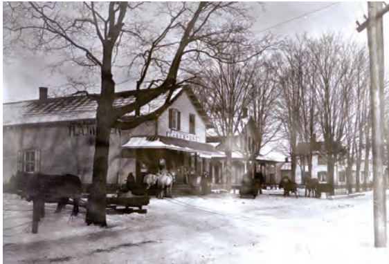
Jeffersonville has many historic buildings.