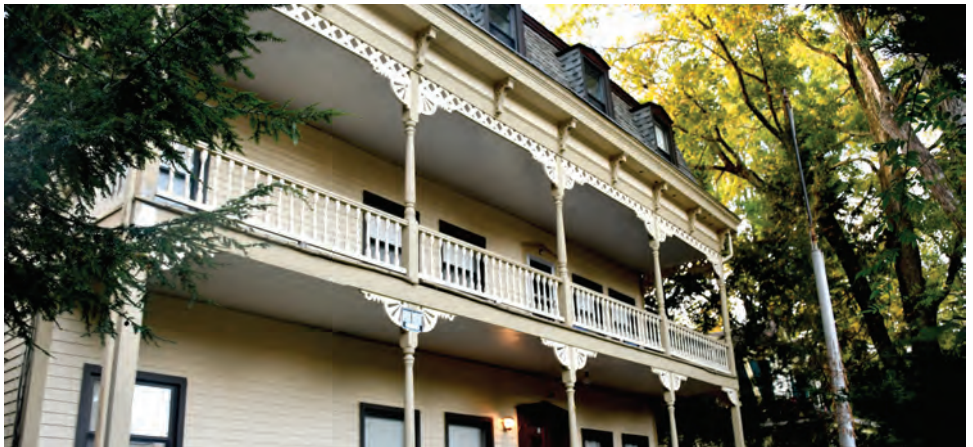
The Maple House is located on Maple Ave., and is steeped in history, including its fabulous design features.

February – I Love Jeff, come to Jeff, hang out, and discover all the reasons to fall in love with Jeffersonville