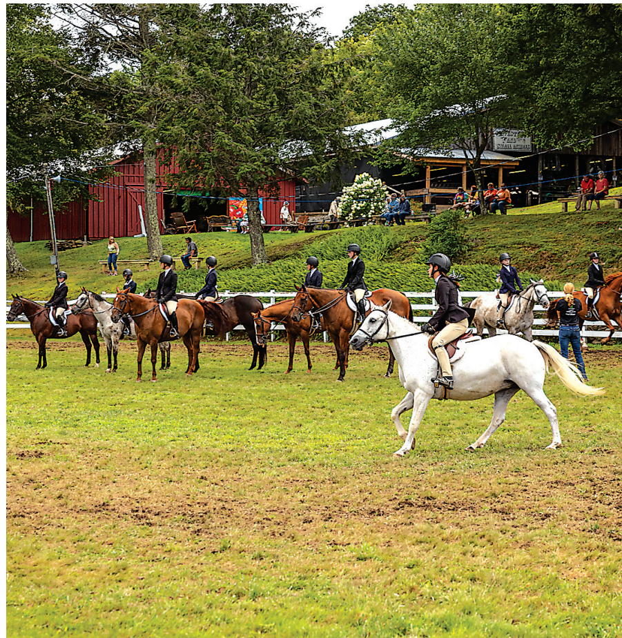
4-H riders line up for their event during last year's Grahamsville Fair.