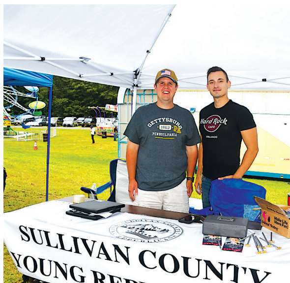
The Sullivan County Young Republicans had a booth at last year's Grahamsville Fair.