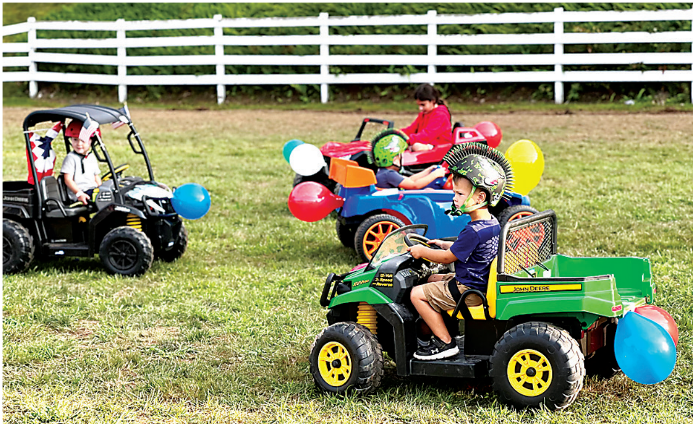
The Power Wheels Derby is entertaining for the kids and fun to watch for the adults. Don't miss this year's competition on Friday, August 16 at 6 pm. Registration is at 5:30 p.m.

Judges of the event can rule that children won't participate if there