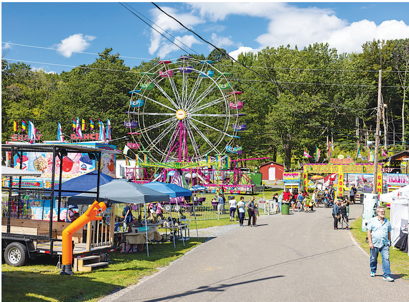
The Grahamsville Little World's Fair midway is full of fun for the entire family including great rides and games of chance.

end full of events to look forward to, including live music and performances.