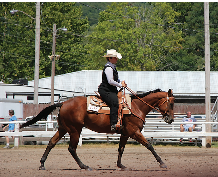
Western style horseback riding is on display at the Fair!