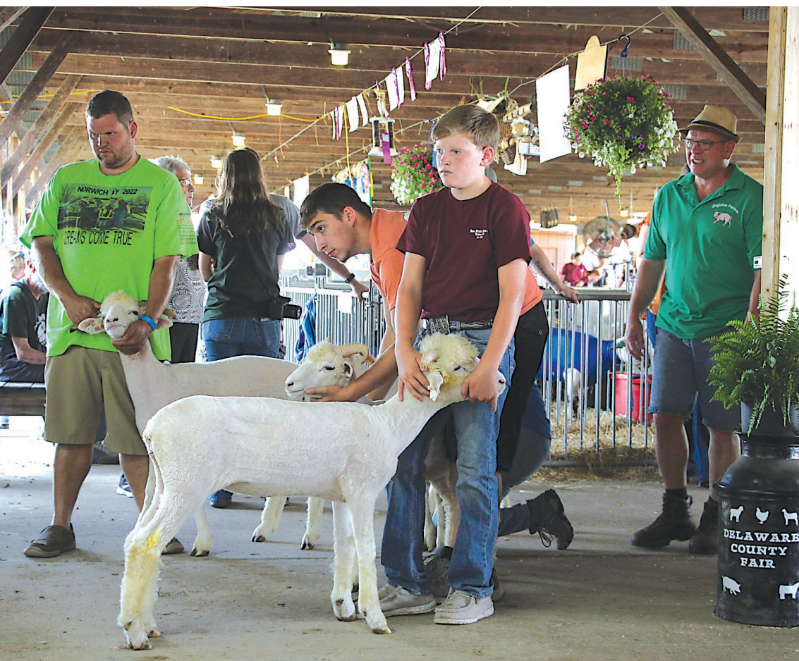
People of many ages participate in the Delaware County Fair sheep show.