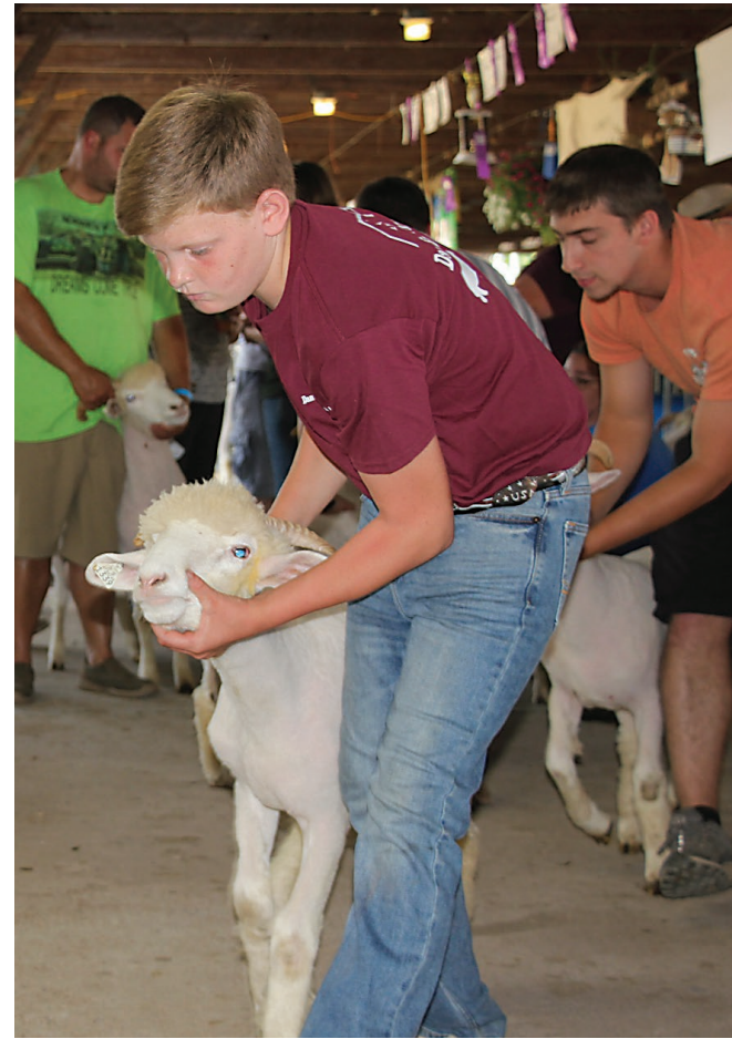
This young man prepares his sheep for the show.