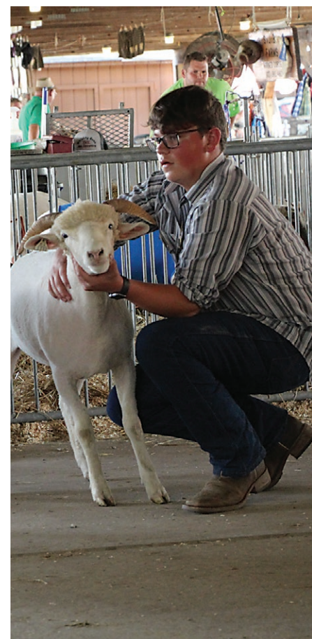
You can hold, clasp, grip, clutch, embrace, and you can drag, pull, hull and heave, but you may not use a leash during the sheep show.