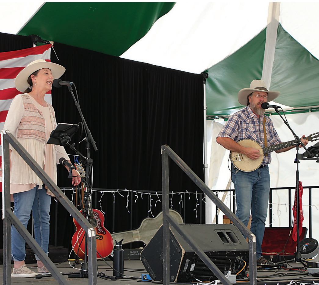
The Barfields entertain the audience under the Entertainment Tent.