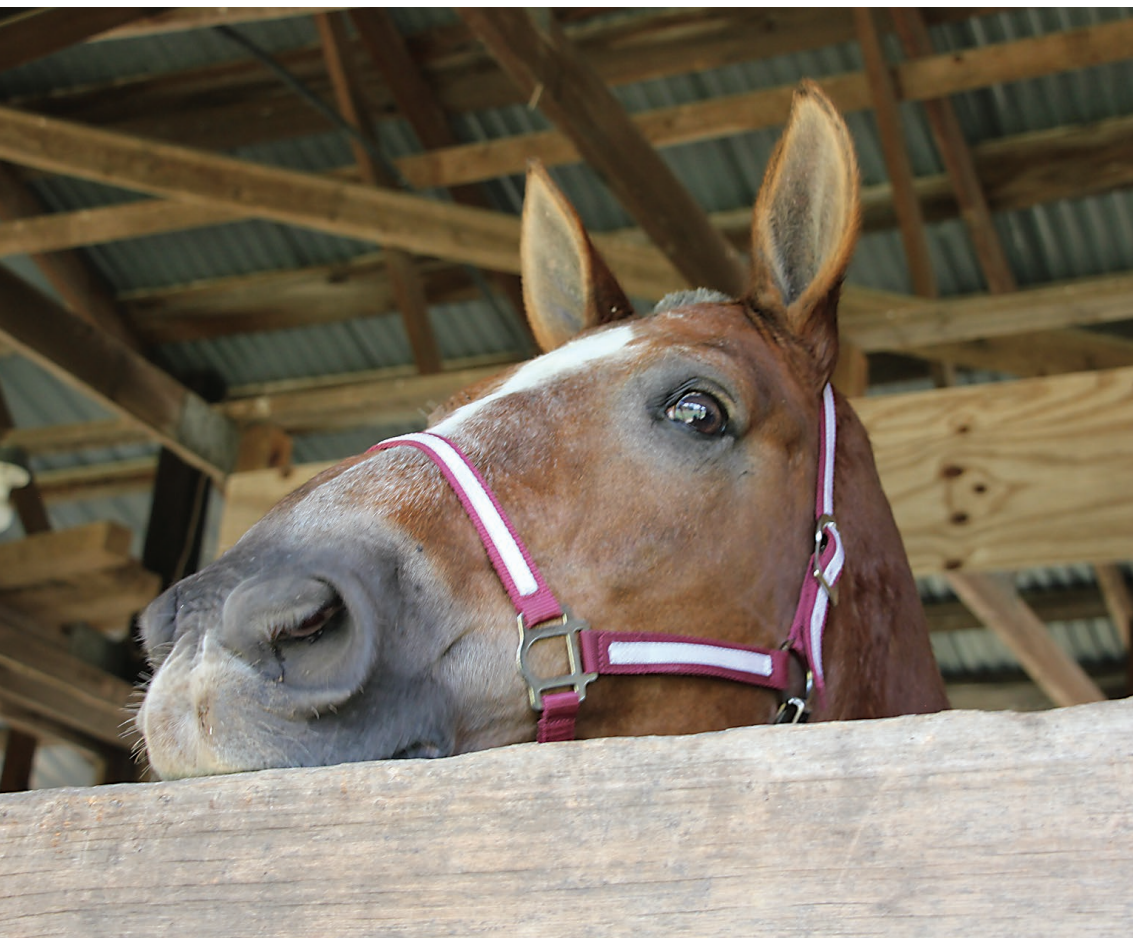
Playing peek-a-boo with a friend.