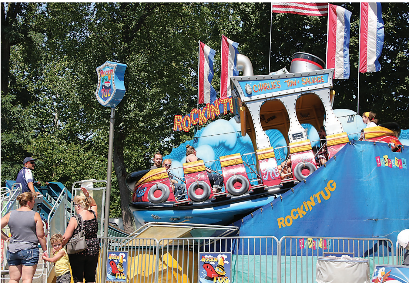
Fairgoers ride the Rockin' Tug boat ride.