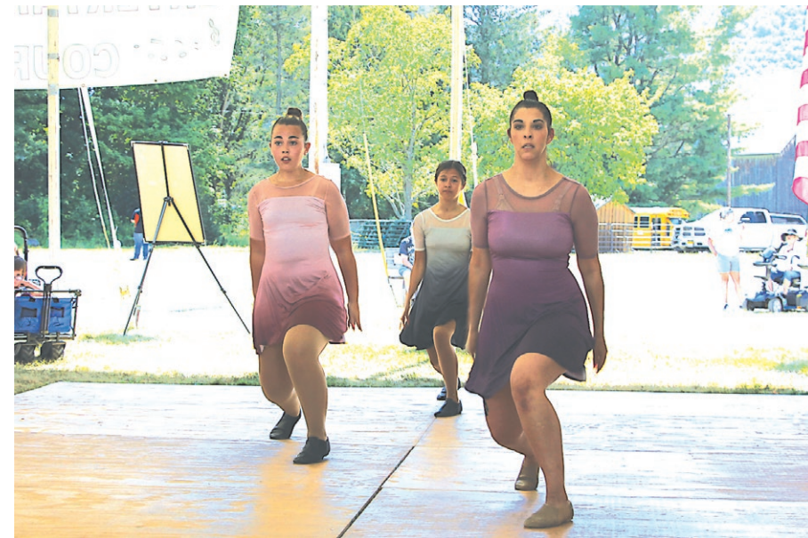
At the Entertainment Tent, students from Catskill Dance Moves show off their talent.