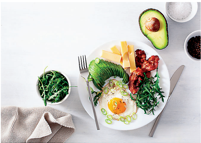
Eggs, avocado, and a form of protein is my favorite breakfast meal to have and it makes me feel great all day long.

Breakfast is a highly debated topic. Many experts advocate for eating breakfast every day, while there are just as many who encourage avoiding it at all costs. Whether or not to eat breakfast is a health decision that will be different for everybody. Skipping breakfast, which is often done by someone participating in intermittent fasting, works wonders for some people. Unfortunately, I am not one of those people and you may not be either. For those of us who are either breakfast lovers or need to eat in the morning to feel our best, let's dive into how to approach our first meal of the day in ways that will help promote health. Our first meal of the day is crucial to our overall health and it dictates how the rest of our day will go. Whether our first meal is at six o'clock in the morning or at noon, what we put in our bodies is very important and something we should pay attention to. After not eating for many hours, our bodies are ready to absorb whatever we give it quickly, and some foods will set us up for an energized day better than others. When we think of breakfast foods, the first thing that comes to mind is often something sweet and full of carbohydrates, like cereal, a