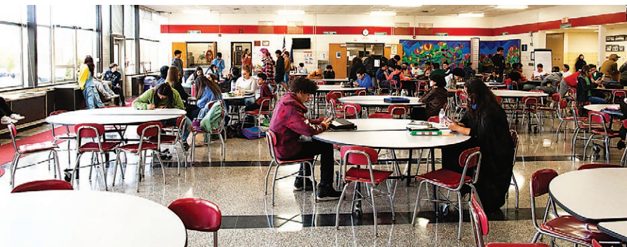
The current state of the cafeteria will undergo enhancements with the upcoming capital project. The goal is to create a brighter atmosphere.