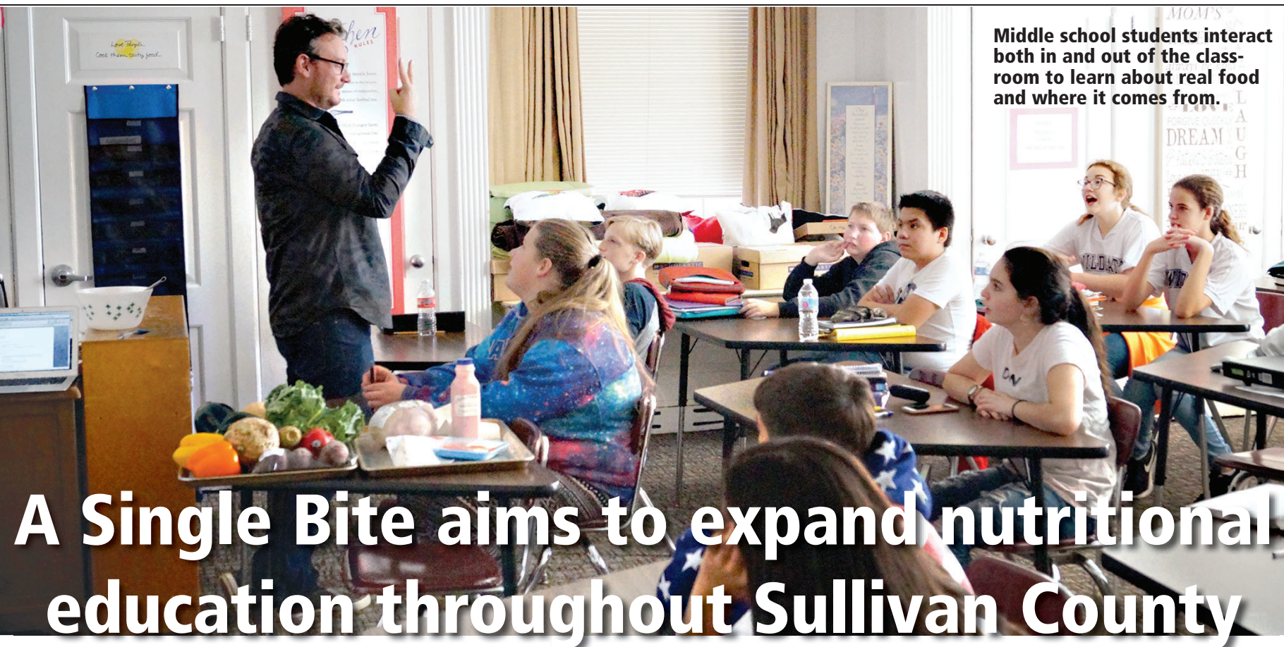
Middle school students interact both in and out of the classroom to learn about real food and where it comes from.