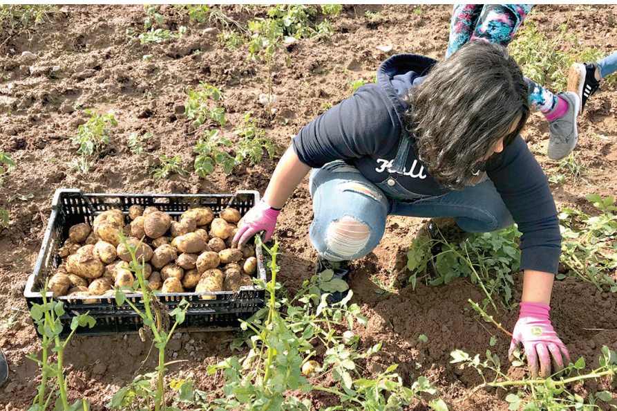
Students hear from local farmers and, if possible, plant or harvest food in their local communities.

To learn more or support this nonprofit, visit asinglebite.org or call 845-482-1030.