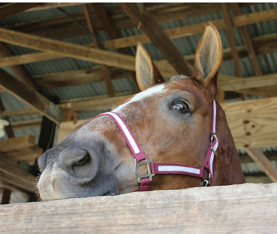
Playing peek-a-boo with a friend.