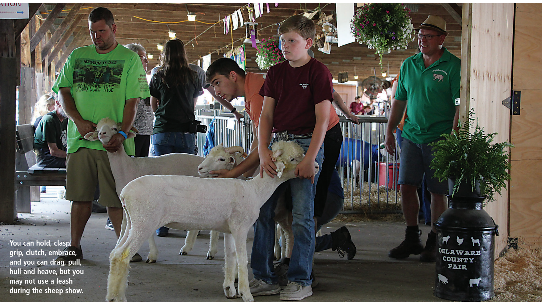
You can hold, clasp, grip, clutch, embrace, and you can drag, pull, hull and heave, but you may not use a leash during the sheep show.

THE JAMES SERIO TEAM KW UPSTATE NY PROPERTIES 116 E. FRONT STREET, HANCOCK, NY 13783 Each Office Is Independently Owned and Operated