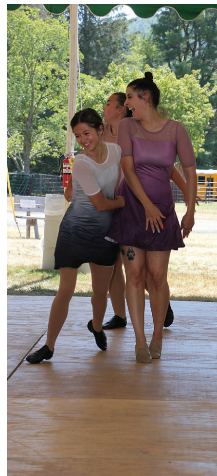
At right: At the Entertainment Tent, students from Catskill Dance Moves show off their talent.

All Day Food Preservation- CCE human Ecology Program As Scheduled Youth Activities (Youth Building) 8 am Open Horse Show - Gymkhana Division 9 am 4-H Master Livestock Showman Competition – Livestock Barn 9 am 11,000 lb Farm & Hot Farm Tractor Pull – Donation to Enter 11 am 4-H Livestock Herdsmanship Awards – Livestock Barn 11:30-1 pm Buffalo & Barfield – Entertainment Court Noon Dairy Cattle Exhibitor Dinner – Dairy Cattle Barn 1 pm Karaoke Finals – Entertainment Court 2 pm 4-H Livestock Auction – Livestock Barn Show Ring 2-4 pm Drying Herbs – CCE Human Ecology Bldg