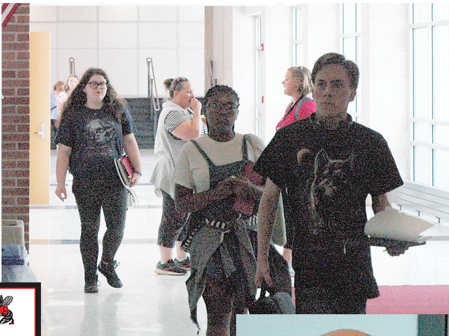
Above: Students of Honesdale High School are held to a high standard of excellence.