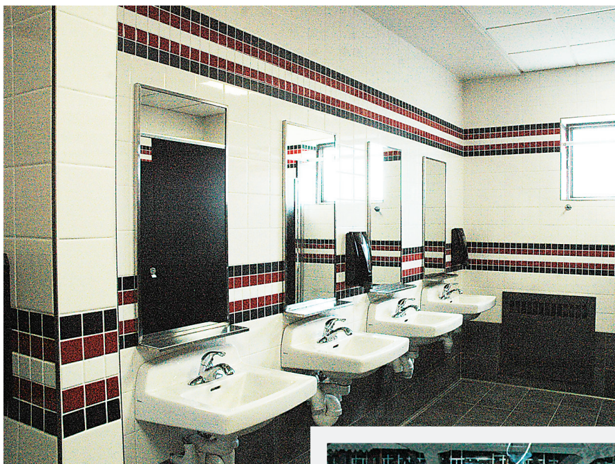
Above: The original 1959 bathrooms received a brand new redesign, lined in Hornet colors - black and red.

Going into a new school year really heats things up in the kitchen as students spend their lunches in the cafeteria, but with the replacement of the walk-in freezer