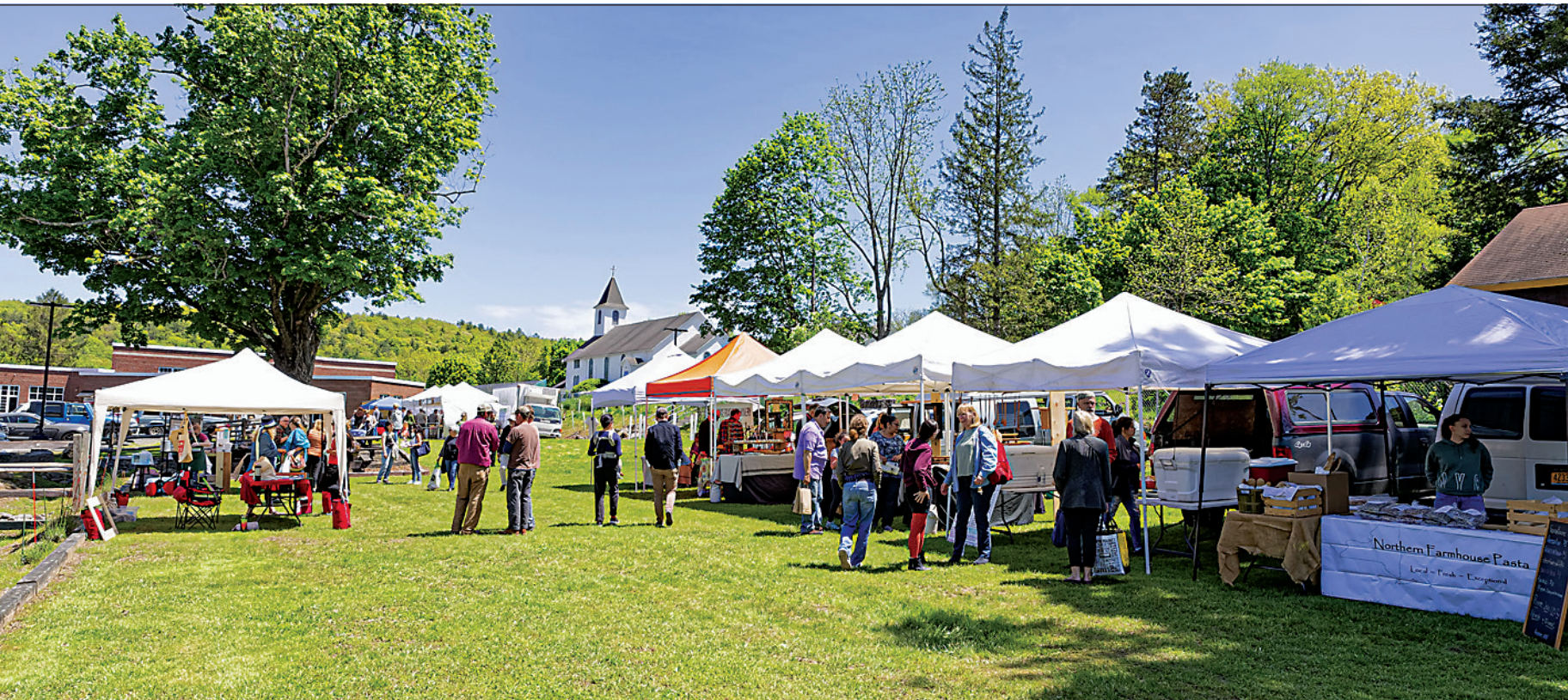
People gather outside to visit the shops to see what vendors are offering.