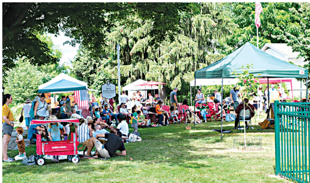
Attendees relaxing in chairs on the grass.

Crowds of people attending the Barryville Farmers Market.