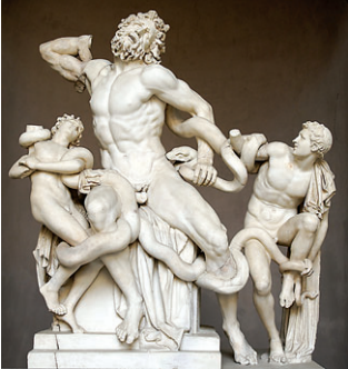
A sculpture that resembles a father with his two children – Laocoön and His Sons, a sculpture by Agostino Caracci, Athenodoros and Polydorus.

The artwork will be on display throughout the month of June as well as hosting a concert of father-themed songs. We are also planning a roundtable panel where people can share their memories, talking about their fathers. Fathers-to-be are welcome as well.