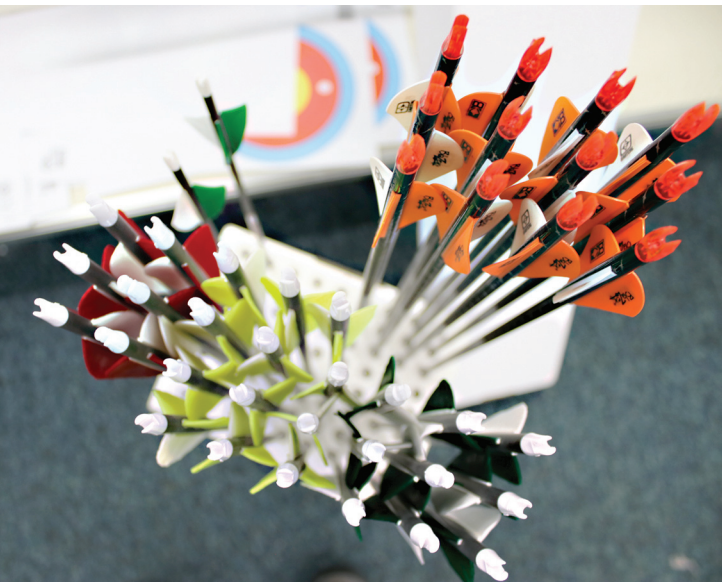
The types of arrows you use in archery depend on the type of bow you're using and the purpose of your shot.