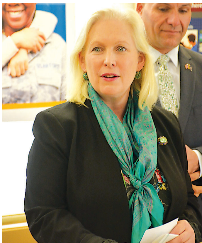
U.S. Senator Kirsten Gillibrand discussing the PACT Act.

"The PACT Act has created a tremendous influx of our younger veterans, which is something that's been sorely needed," he said. "It's really increased the traffic through the office. Our claims submitted and all of our actions to the VA have quadrupled