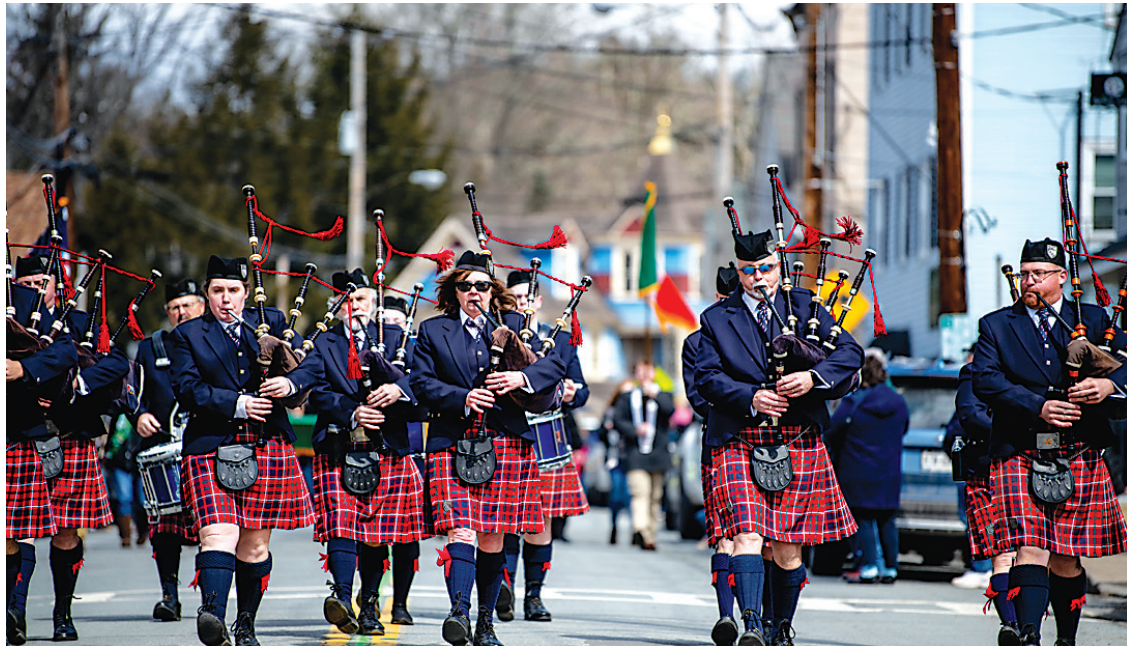
RIGHT: Members of Firefighter McPadden Pipes and Drums make their way down Main Street.

T he green came out for the day in Jeffersonville on Saturday for the county's only St. Patrick's Day Parade.