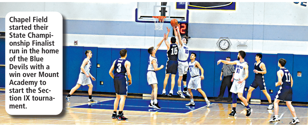
Chapel Field started their State Championship Finalist run in the home of the Blue Devils with a win over Mount Academy to start the Section IX tournament.