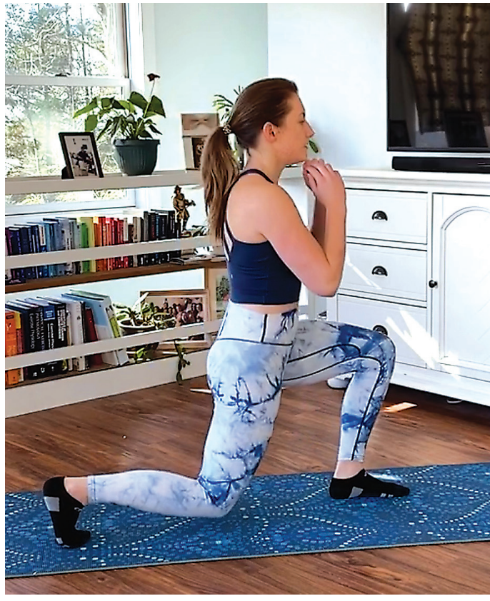
When used properly, fitness challenges can help us generate momentum as we shift into a season where we're more focused on our health and fitness.

This has led me to shy away from recommending or hosting challenges altogether. However, as I've gotten older and more experienced in coaching,