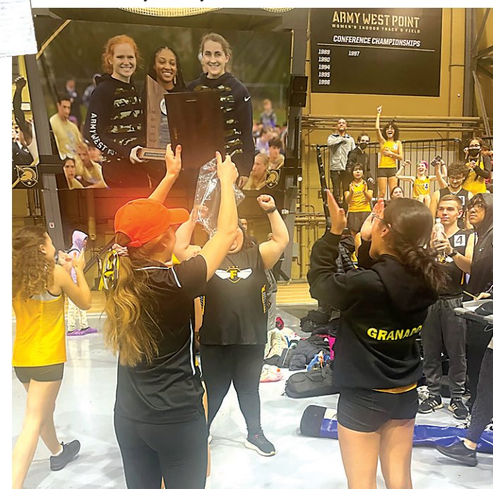
The Lady Comets raise their Division V plaque after winning at West Point on January 21.

"I told the team that if we wanted to put Fallsburg on the map, we have to start now. All that hard work, stress, dedication and sacrifice paid off. That was the best moment, not just for me but for them as well."