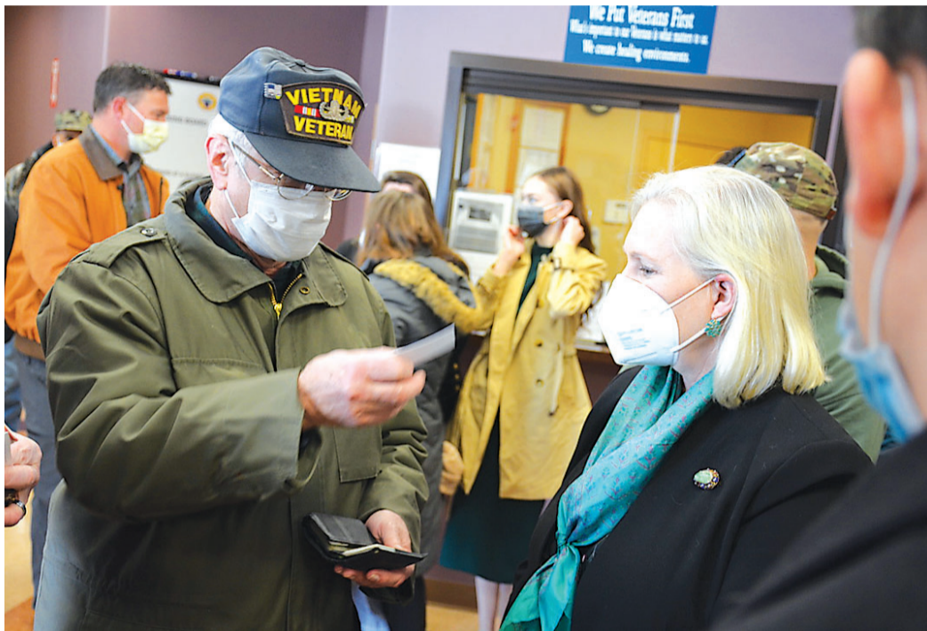
Local veterans had the opportunity to speak with U.S. Senator Kirsten Gillibrand and members of her staff on Friday.