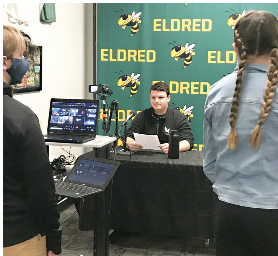
Students getting ready to broadcast the morning announcements on YouTube in the new Video Center.