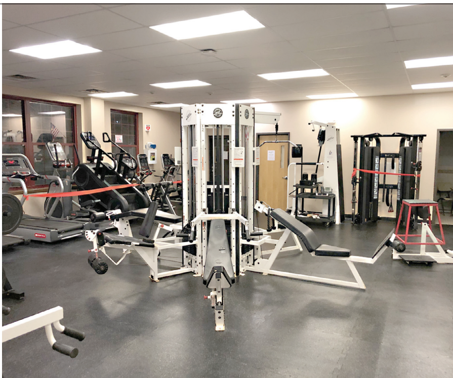
With new equipment, the Eldred Central School District Community Gym has reopened.