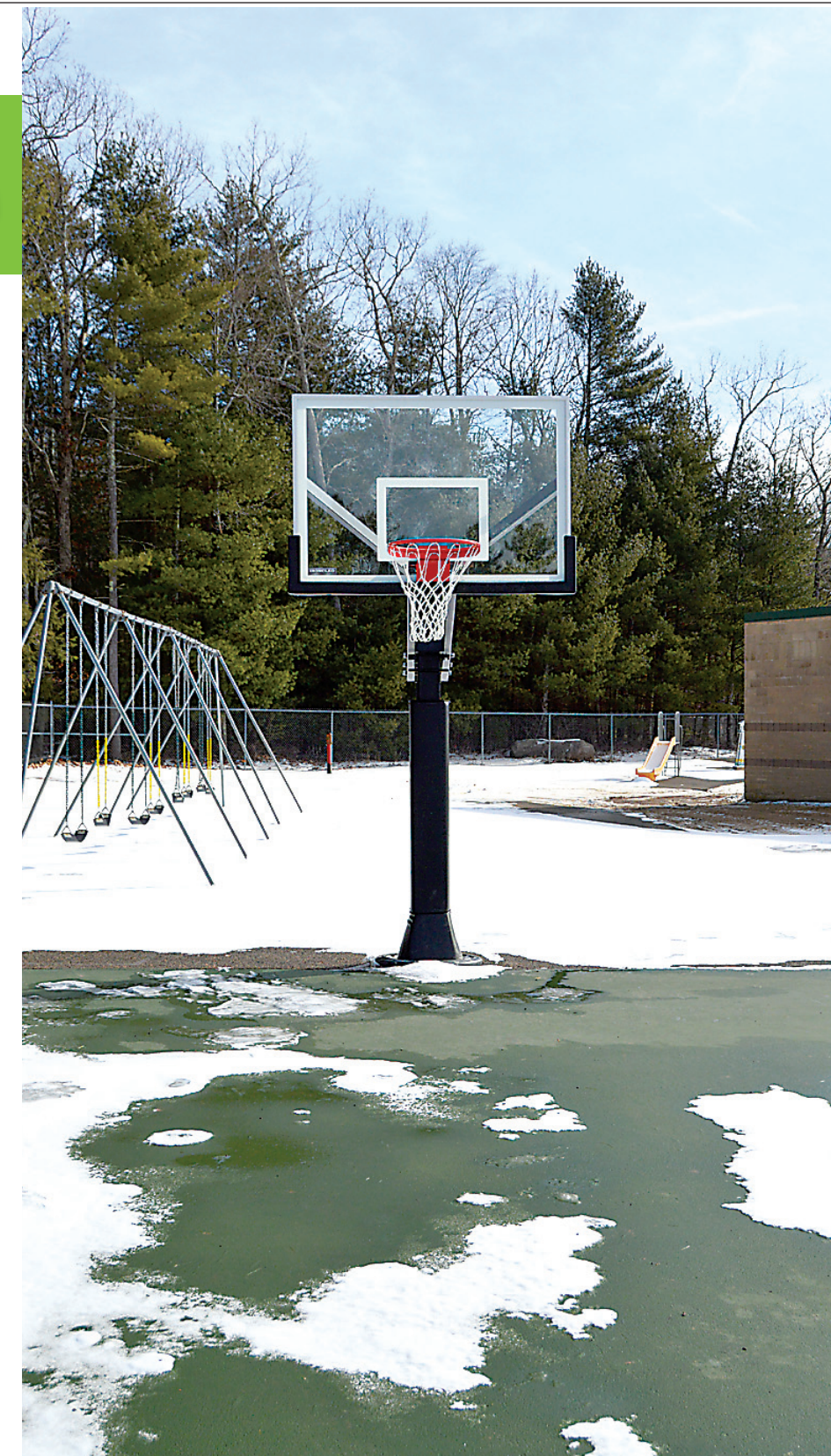
With the new placement of the playground, George Ross Mackenzie Elementary School will now have a basketball court for all grade levels.

Students who are not on the council can bring their ideas or