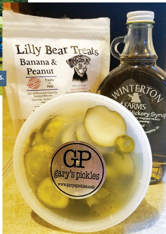
Lilly Bear Treats, Winterton Farm's Hickory Syrup, and Gary's Pickles are waiting to share their locally made and sourced products with Mamakating.

The vendors were ready to share their products from natural dog treats, pickles, locally grown produce, locally made syrups and honey to hand-