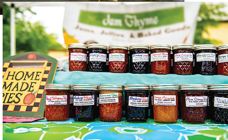
Eileen Reimer's Jam Thyme jam is a hit at any market. Try the banana jam with peanut butter for a twist on an old favorite!