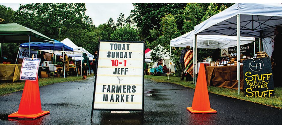
The market is practicing COVID safety protocols.

What you get at the market depends on what's in season! Radishes are here ... for now!