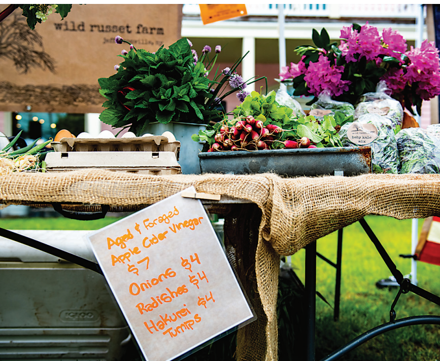
Wild Russet Farm is one of a host of farmers bringing the fruits of its harvest to the market.