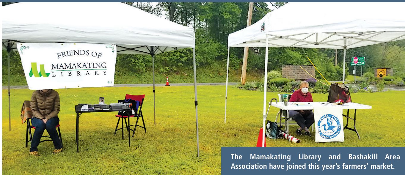
The Mamakating Library and Bashkill Area Association have joined this year's farmers' market.