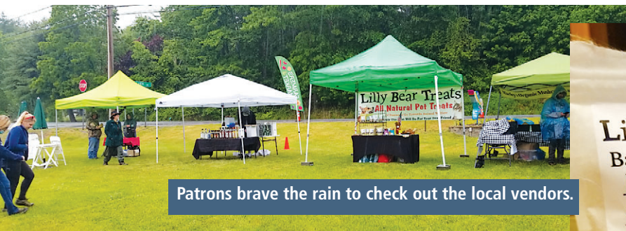
Patrons brave the rain to check out the local vendors.