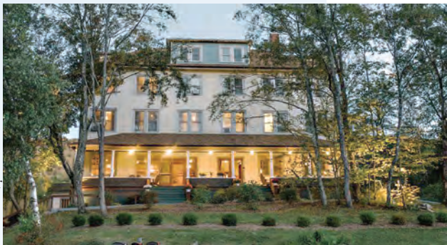
Wintertime sleepover at the DeBruce

We are a destination where travelers can safely seek what they need to satisfy their inner wanderlust impulses. Whether it's a vacation for tranquility, adventure or to attend events, the Sullivan Catskills is a responsible destination ready for whatever the future holds. And the SCVA is prepared to promote the best travel opportunities available for all types of travel enthusiast.