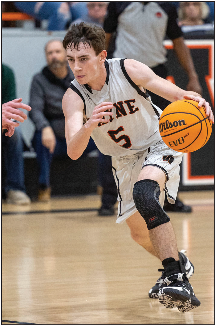
Greg Gaston • double g images