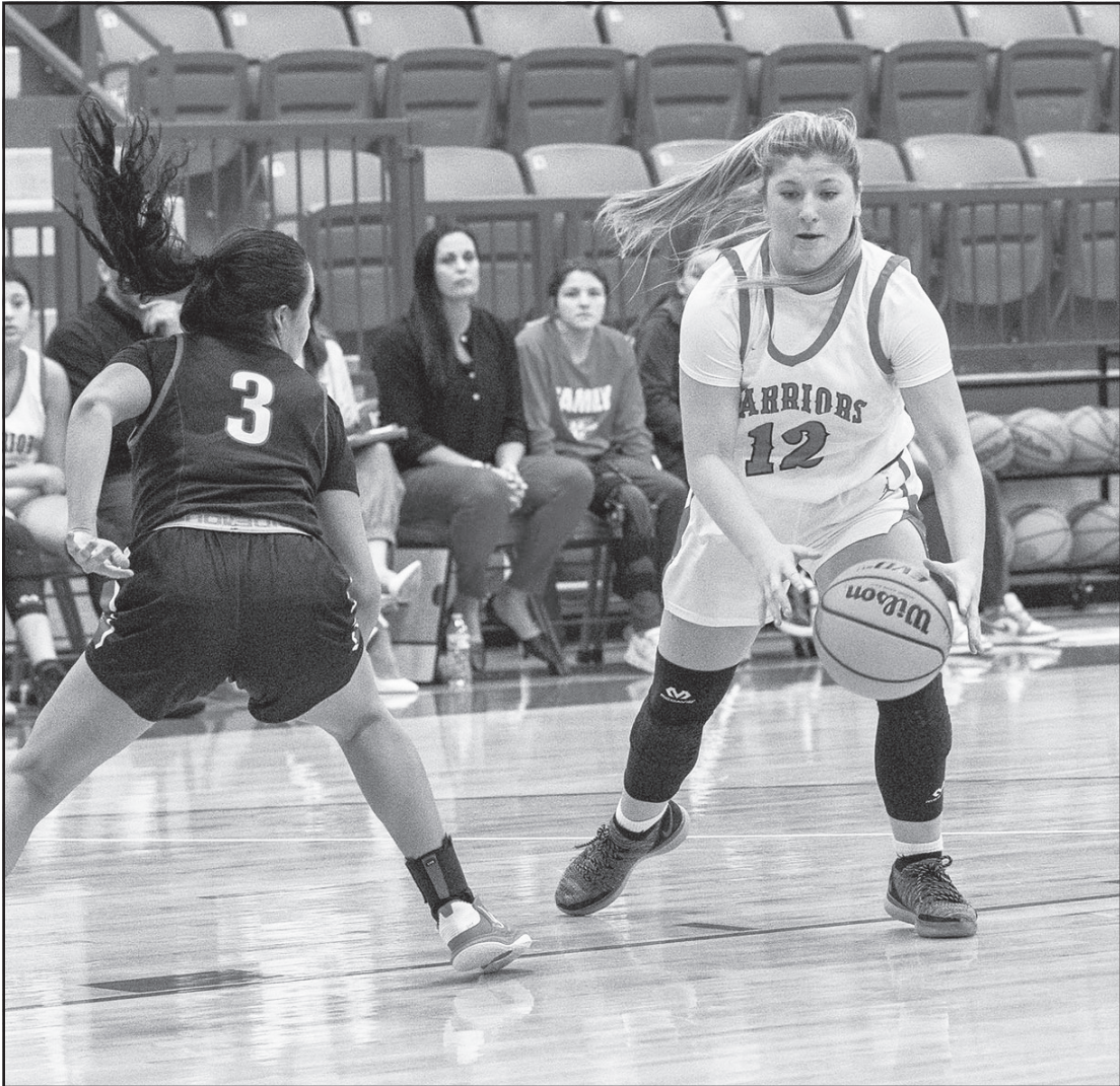
Greg Gaston • double g images