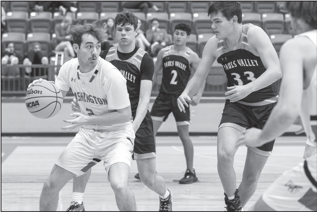
From page 1B