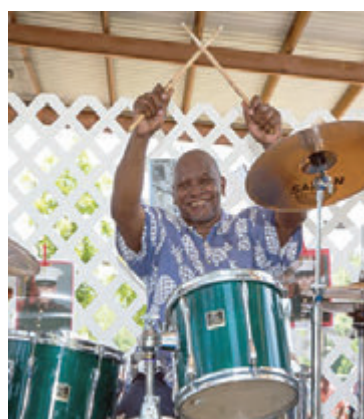
The band, Tighten UP, preforms for the Shepherd 4th of July party.