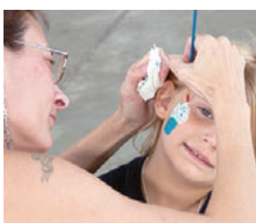
Face painting was one of the highlights of the afternoon for the younger crew enjoying the Shepherd Freedom Festival.