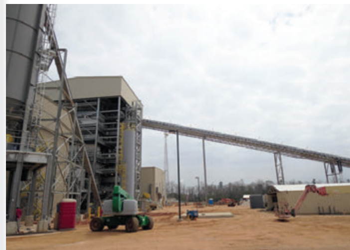
East Texas Electric Cooperative's new Woodville Renewable Power Facility, which is nearing completion, will produce 49 megawatts of clean, carbon-neutral electricity close to home for Cooperative members. It will also diversify ETEC's generation portfolio for its distribution cooperative members, including Sam Houston EC.

Sam Houston EC received its charter May 16, 1939, and has been providing electricity to East Texas ever since. The Cooperative was founded by a handful of farmers and rural residents who dreamed of bringing "power to the people." In the early 1940s, there were just over 600 Co-op members. Today, Sam Houston EC serves 52,000 members and nearly 70,000 meters across parts of 10 counties.