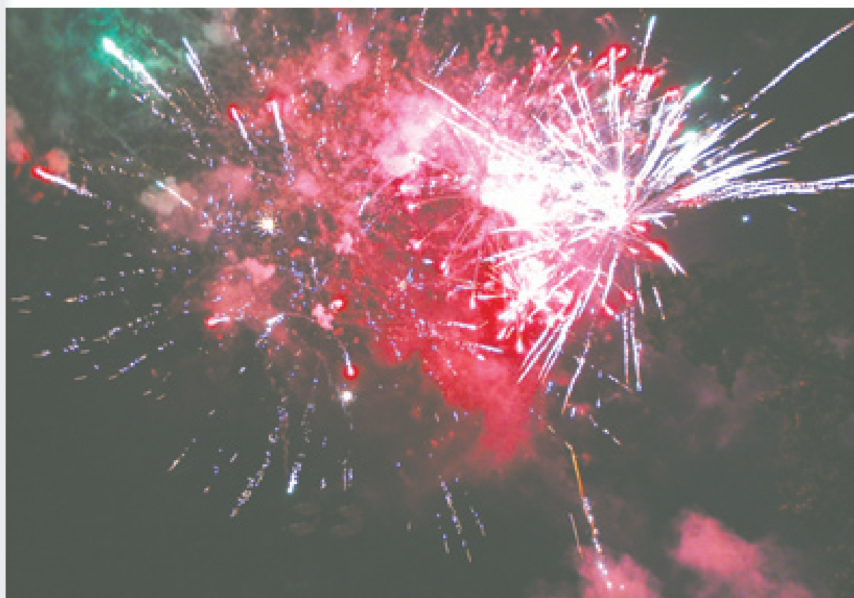
Fireworks were captured over the Alabama-Coushatta Indian Reservation in Livingston as well as in the City of Shepherd on Saturday, July 5, celebrating the Fourth of July.