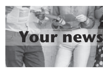
Your news. Your way.

HOKE STUMP Grinding- No job too large or too small. Call (936)295-6089 or (936) 581-3781. Trinity, TX. (11-tfn-b-TCNS)