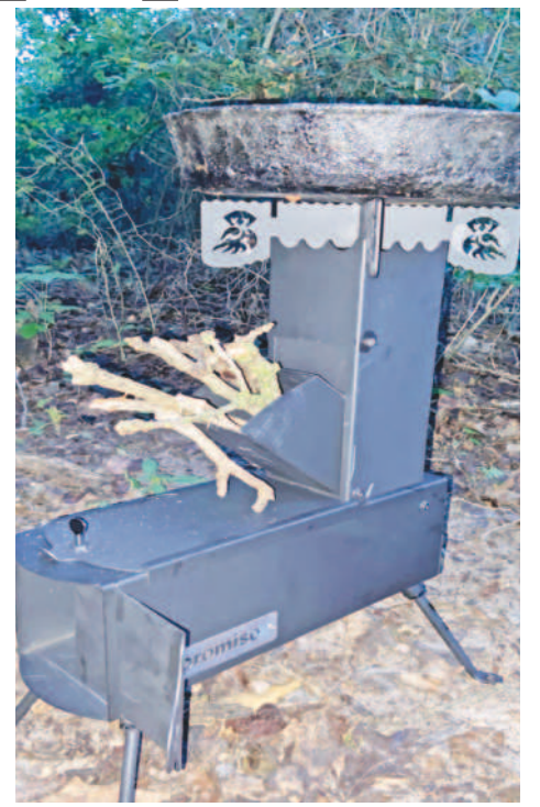
This little rocket stove is the newest addition to Luke's outdoor cooking arsenal.

My first attempt at cooking with my little stove was a big success. I thought it best if I did a little solo test cook rather than risk disappointing a few guests. I amassed a good supply of dry twigs, used some crumpled paper to get the fire going and within five minutes, had a very intense fire at the top of the vertical pipe that in short order