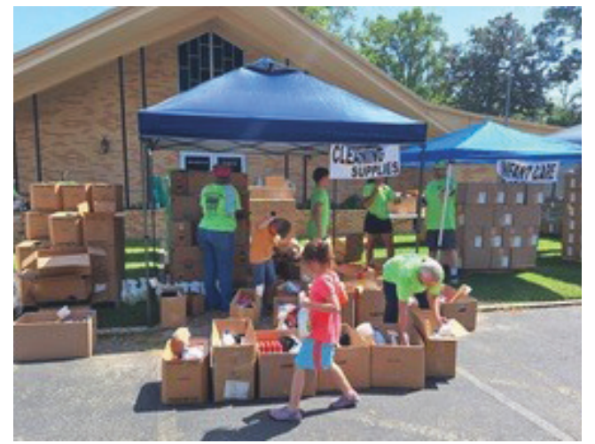
Shepherd Church of Christ distributed goods to nearly 250 families, including food, cleaning supplies, clothes and more.