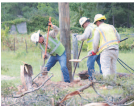
Entergy crews work to restore power in the Cleveland area following the devastation from Hurricane Beryl. Entergy claims all customers able to safely receive power have had it restored.