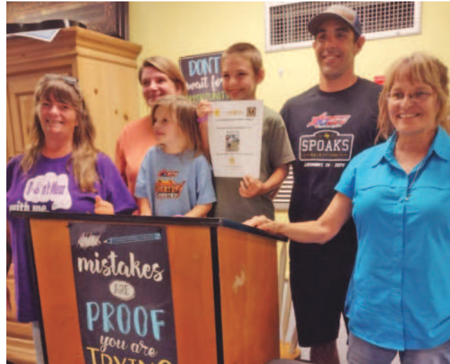
The Impact Center gives an award for community service.