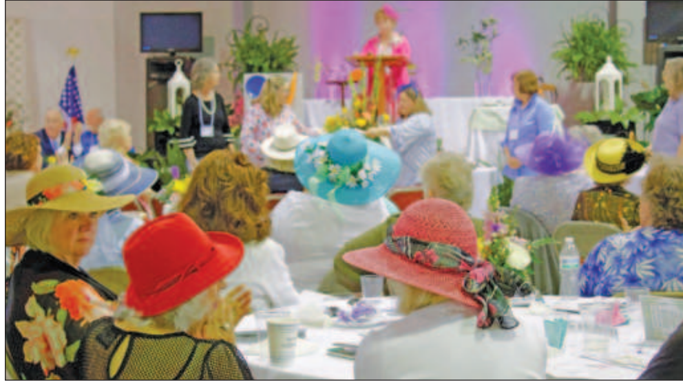
Attendees wearing their hats and pearls for the event.