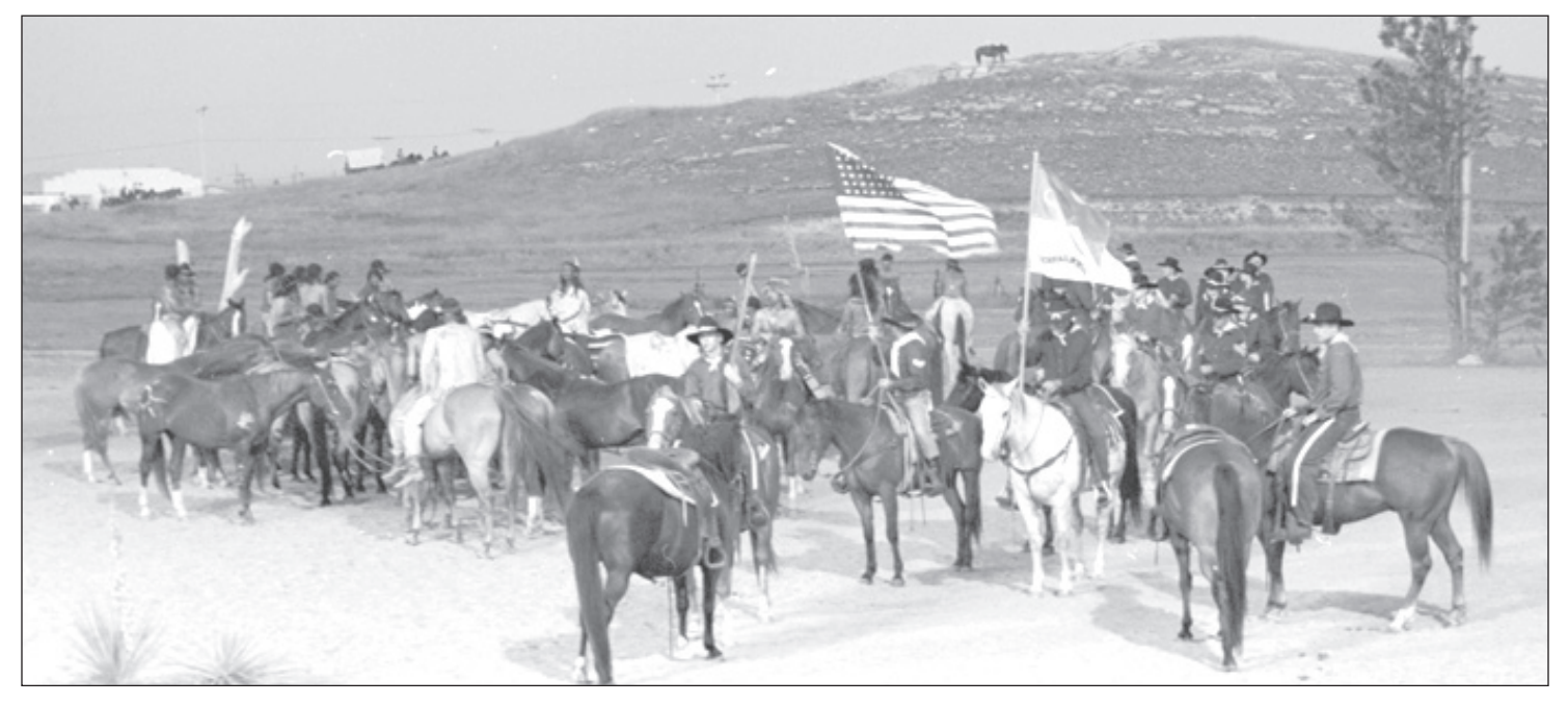
FILE PHOTO A photograph of the rawhide events over the past years.

The Legend of the Rawhide is scheduled for July 12-13, 2024, and events kick off with the pre-show on Friday, July 12 at 7:30 p.m. This year's featured concert features Southern Fryed.