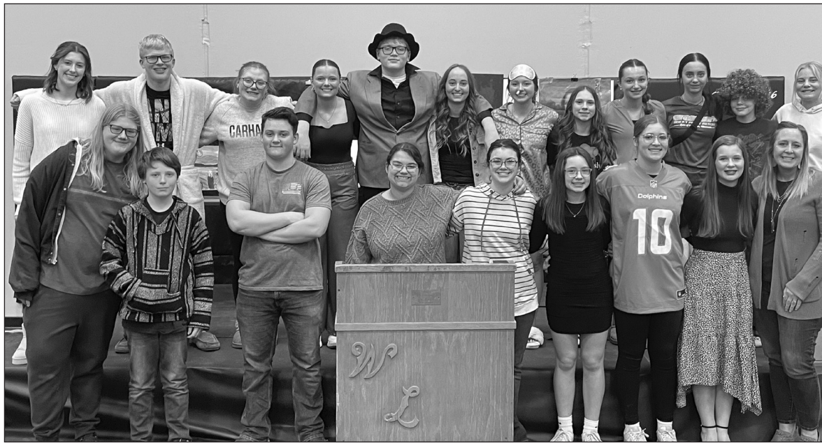
Members of the Willow Lake cast and crew of the recent all-school play that was performed.