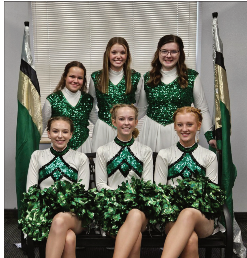
On the Cover — See Page 2