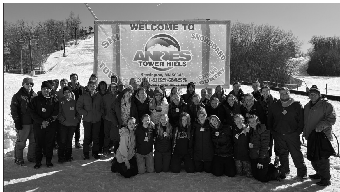
Willow Lake High School students enjoying a day on the slopes during a field trip this winter.