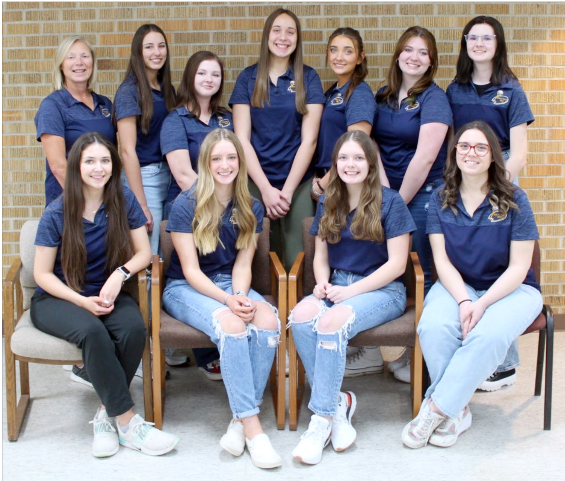
Jess Gatzke/Jae Ann Photography