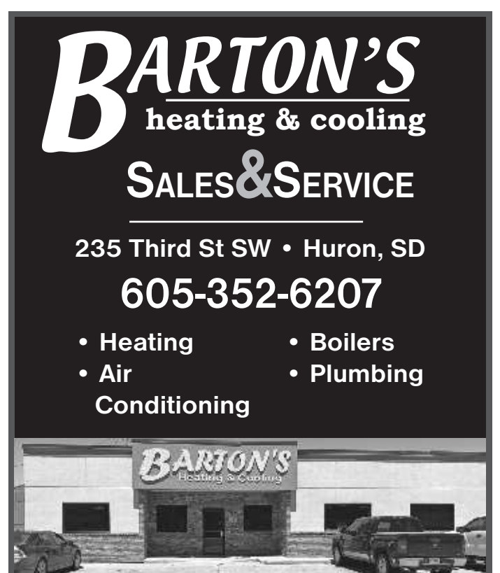
Rheem Furnaces and Air Conditioners

This year, resolve to update your home to suit your style and everyday needs. Let these five trends inspire you in your home renovation and decoration endeavors in 2024!