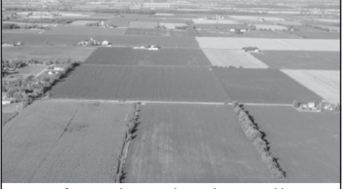
If you have land to sell, now is the time. Real Estate, Farm and Person Property Auctions.