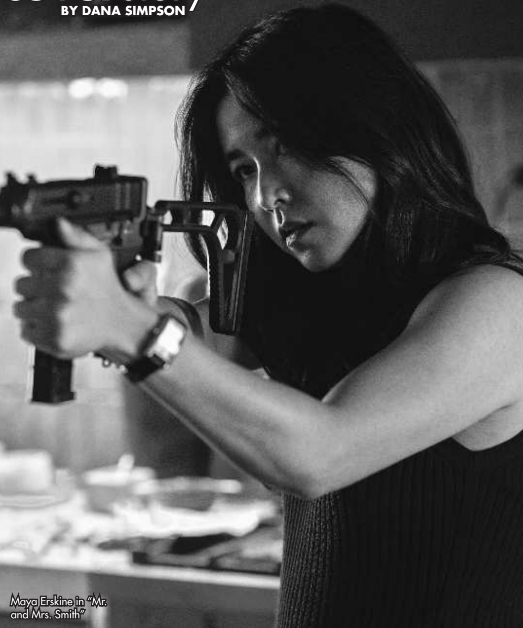
Maya Erskine in "Mr. and Mrs. Smith"