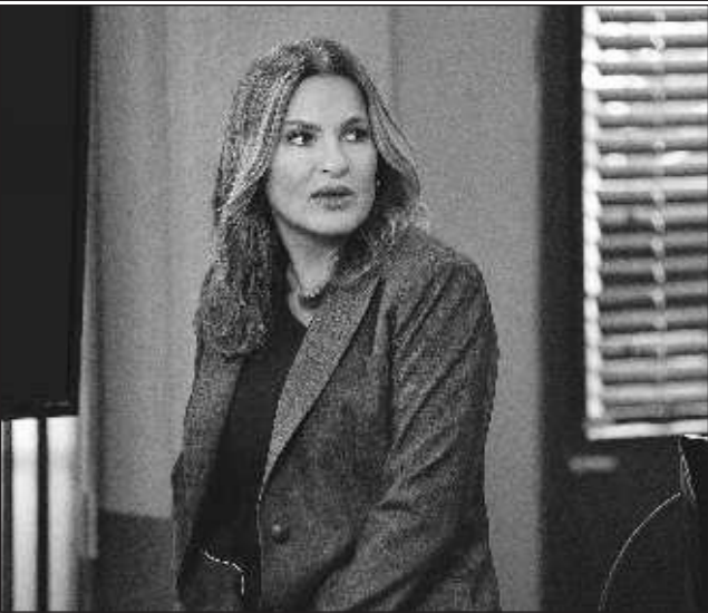
Mariska Hargitay in "Law & Order: Special Victims Unit"