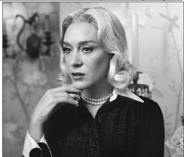
Chloe Sevigny stars in "Feud: Capote vs. The Swans"

Returning for its Season 2 premiere seven years after the first, this season focuses on writer Truman Capote (Tom Hollander), a confidant to New York's most celebrated society mavens. Well, until he betrayed them in writing, which led to his destruction.