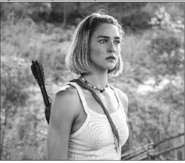
Zyra Gorecki stars in "La Brea"