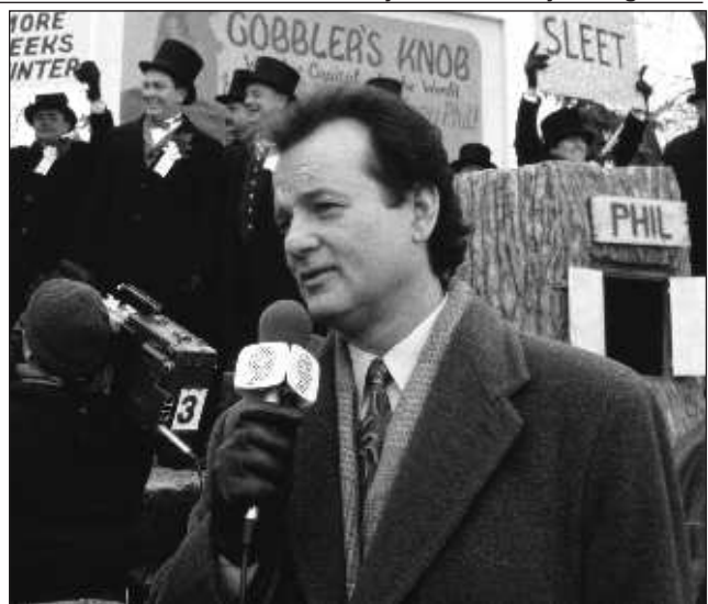
Bill Murray in "Groundhog Day"

Don't look down. There's a chance that there is an unknown world taking place just below our feet. Host Dan Aykroyd examines the weirdness that is happening below the earth's surface, including tunnels dug by giant sloths, hidden cities and death traps.