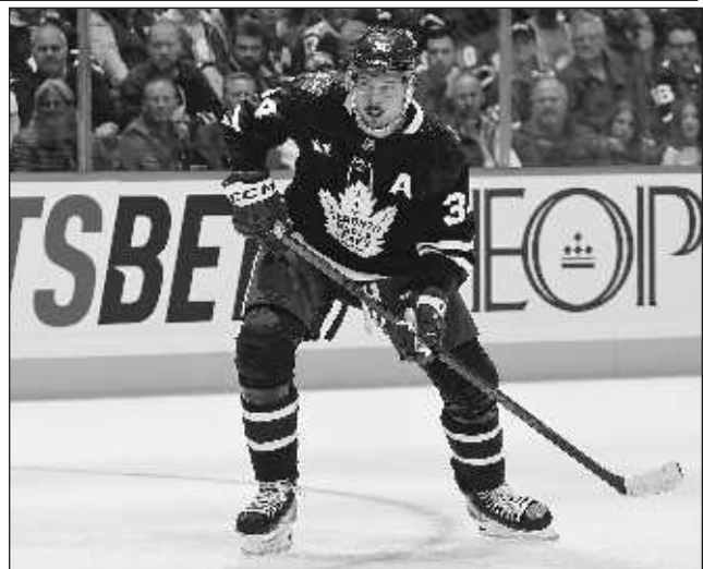
Auston Matthews serves as one of the captains for the 2024 NHL All-Star Game

Country Music Hall of Famer Tanya Tucker sings songs from "Sweet Western Sound" and Brittney Spencer performs songs from her debut album, "My Stupid Life," in a nother brand-new episode of this long-running concert series, featuring memorable performances by artists from every genre.