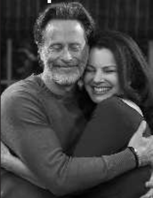
Steven Weber and Fran Drescher

Thursday 7 p.m. on 49 5 Brooklyn Nine-Nine Former "Saturday Night Live" regular Vanessa Bayer joins Season 7 in the recurring role of uniformed officer Debbie Fogel, who finds herself partnered with ... Capt. Raymond Holt (Andre Braugher)? For fans who don't remember, at the end of Season 6, Holt's professional nemesis, now acting commissioner Madeline Wuntch (guest star Kyra Sedgwick), found an excuse to force Holt to spend several hours on traffic patrol duty. The one-hour season premiere also sees the return of series regulars Andy Samberg, Terry Crews and Joe Lo Truglio, among others.