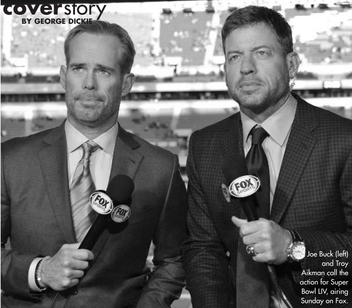
Joe Buck (left) and Troy Aikman call the action for Super Bowl LIV, airing Sunday on Fox.

It's their biggest broadcast of the year, one that will put more ears and eyeballs on them than perhaps with any other TV show this year.